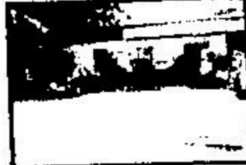
The established business in Acton is now for sale. It is the opportunity you've been looking for! Call Marvyn Morgan at 853-2074.