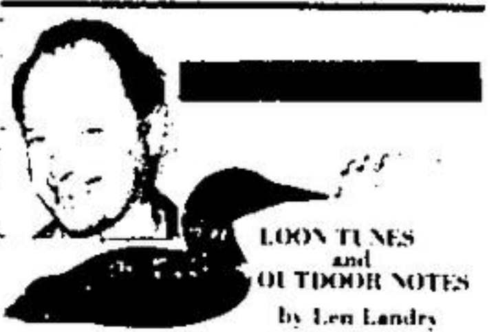
LOON TINES and OIL TENDER NOTES by Len Landry

Part II of: "The bass that jumped for the sun."