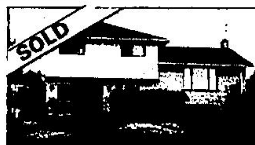
5 ACRE — REDUCED $239,900