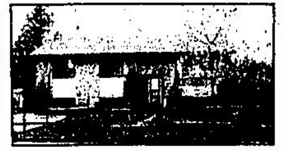
GOING — GOING PICTURE PERFECT $160,900 WITH IN-LAW SUITE