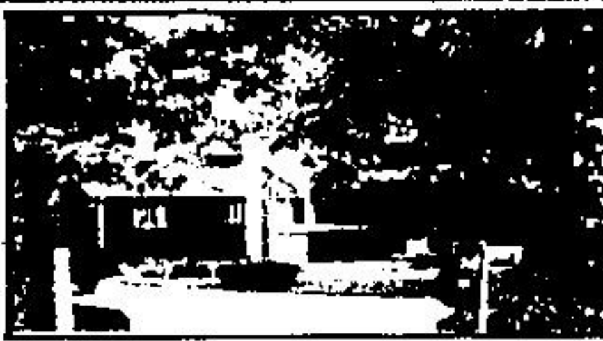
FRONTAGE 614 PICTURESQUE TREED 10 ACRES REDUCED $265,600

5 acres just on the edge of town for that "Estate home of yours". Asking $249,000.