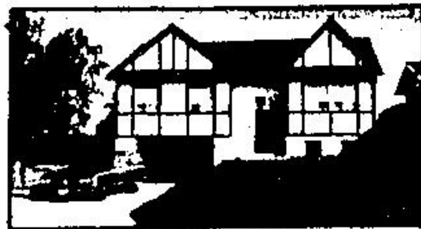
VIEW OF LAKE LOVELY NEW BUNGALOW REDUCED TO $164,500