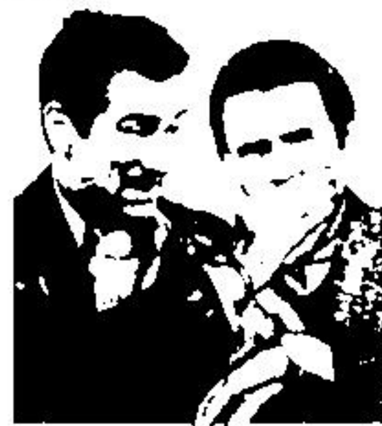
ROBERT DE NIRO