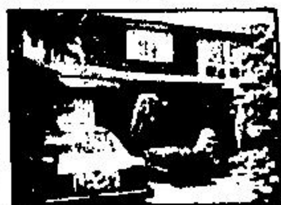
OPEN HOUSE 200 ELMORE DRIVE ACTON

"Acton's Early Days" was used as a reference.