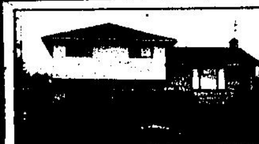
5 ACRE — REDUCED $239,900