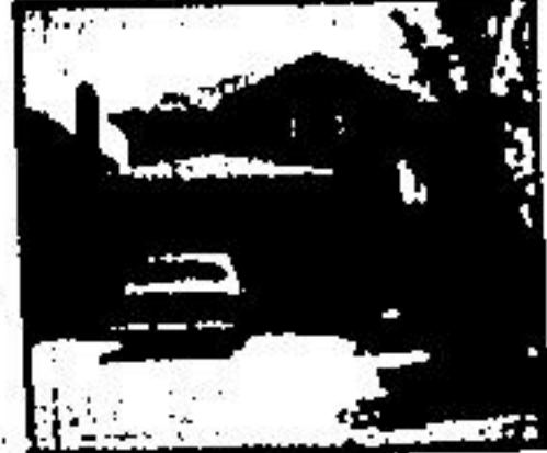
IS THIS LUXURIOUS 2626 SQ. FT. HOME FOR YOU?