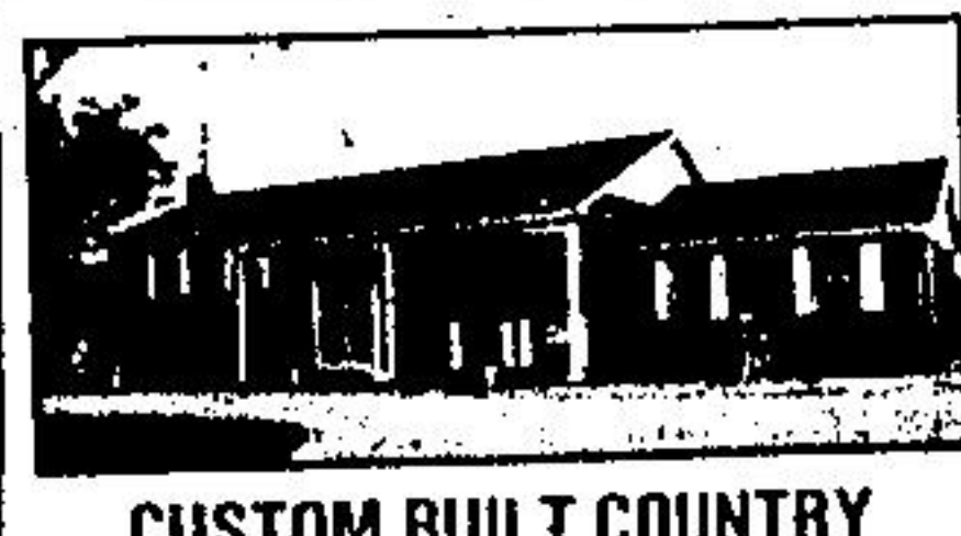
CUSTOM BUILT COUNTRY BUNGALOW — 45 ACRES $315,000