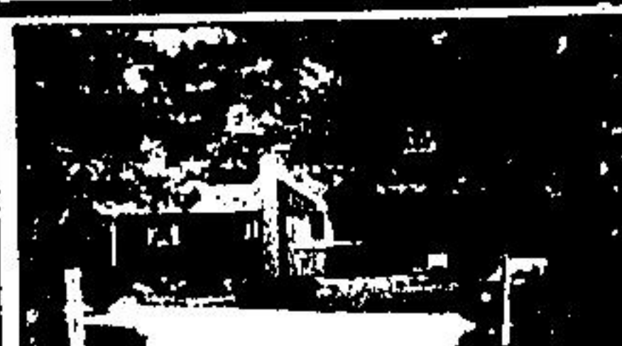
PICTURESQUE TREED 10 ACRES $269,000.