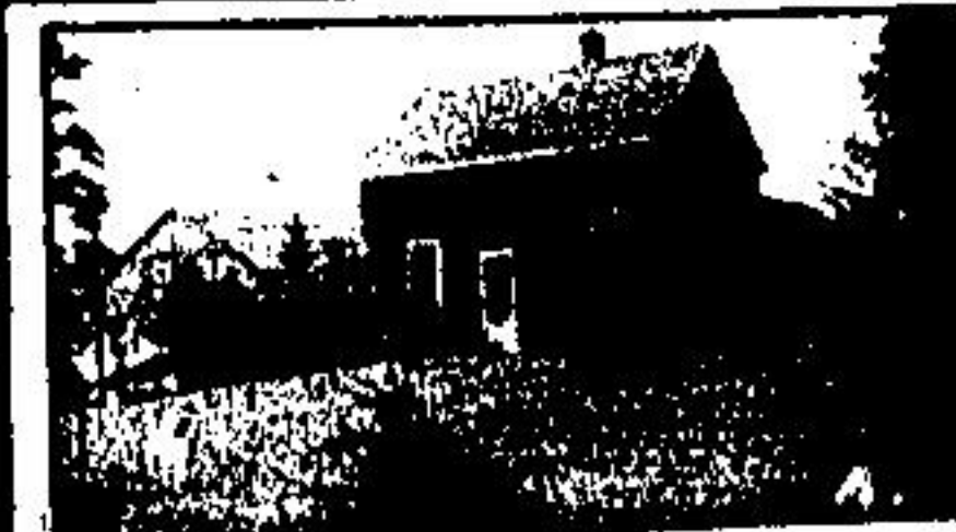
35 ACRE HORSE RANCH $249,900