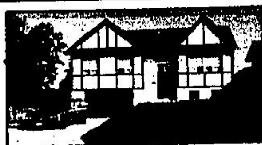
LOVELY NEW BUNGALOW REDUCED TO $164,500