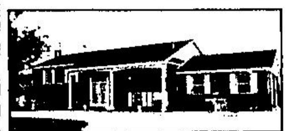
CUSTOM BUILT COUNTRY BUNGALOW — 45 ACRES $315,000