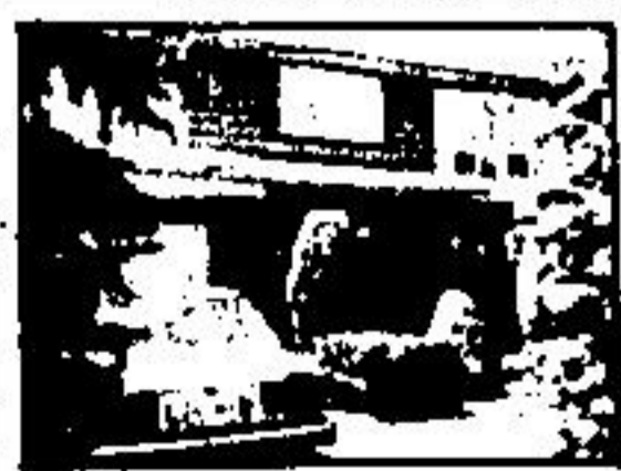
OPEN HOUSE 200 ELMORE DRIVE ACTON

***** "Acton's Early Days" was used as a reference.