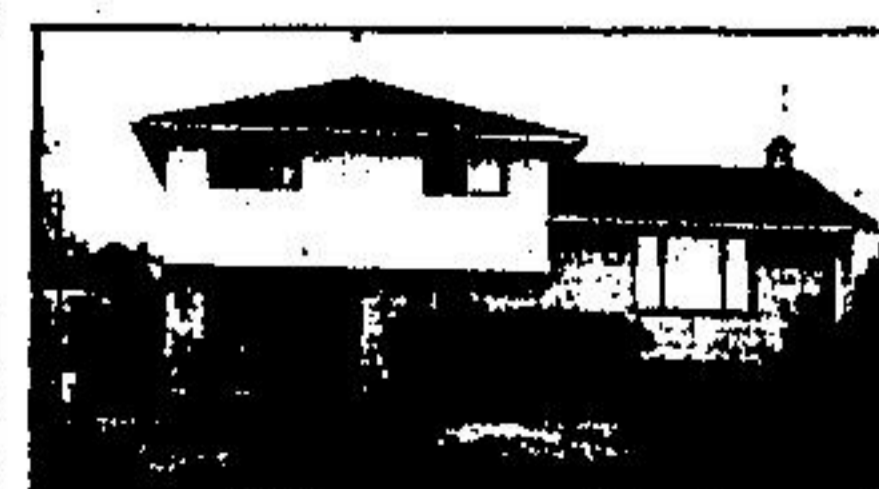
5 ACRE — REDUCED $239,900