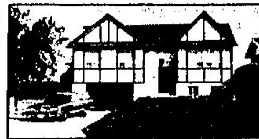
LOVELY NEW BUNGALOW REDUCED TO $164,500