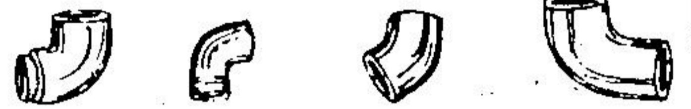
Copper Pipe Fittings For Making Bends And Turns

Use with care CAUTION... Use your propane torch with care. There are many fires started every year through their careless use. Also never use acid core solder for plumbing work! Use solid core solder only.