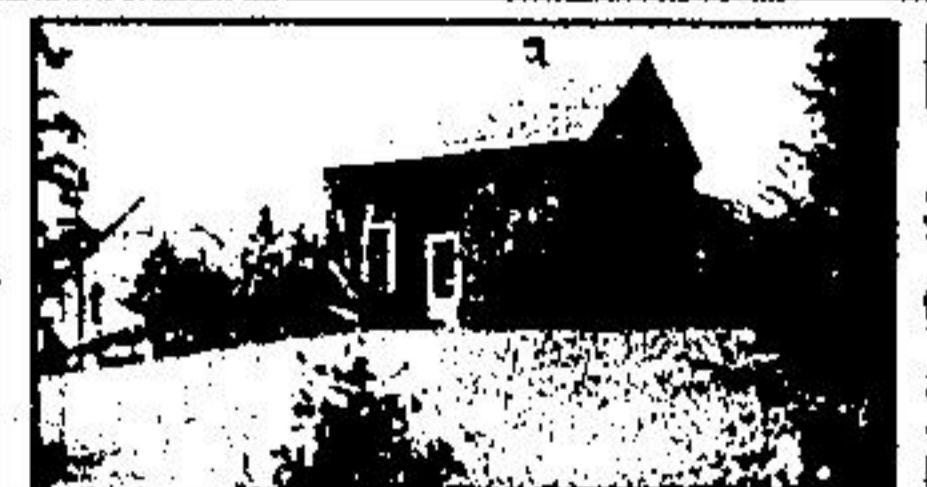
35 ACRE HORSE RANCH $249,900