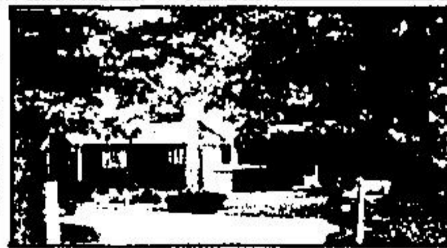
PICTURESQUE TREED 10 ACRES $269,000.