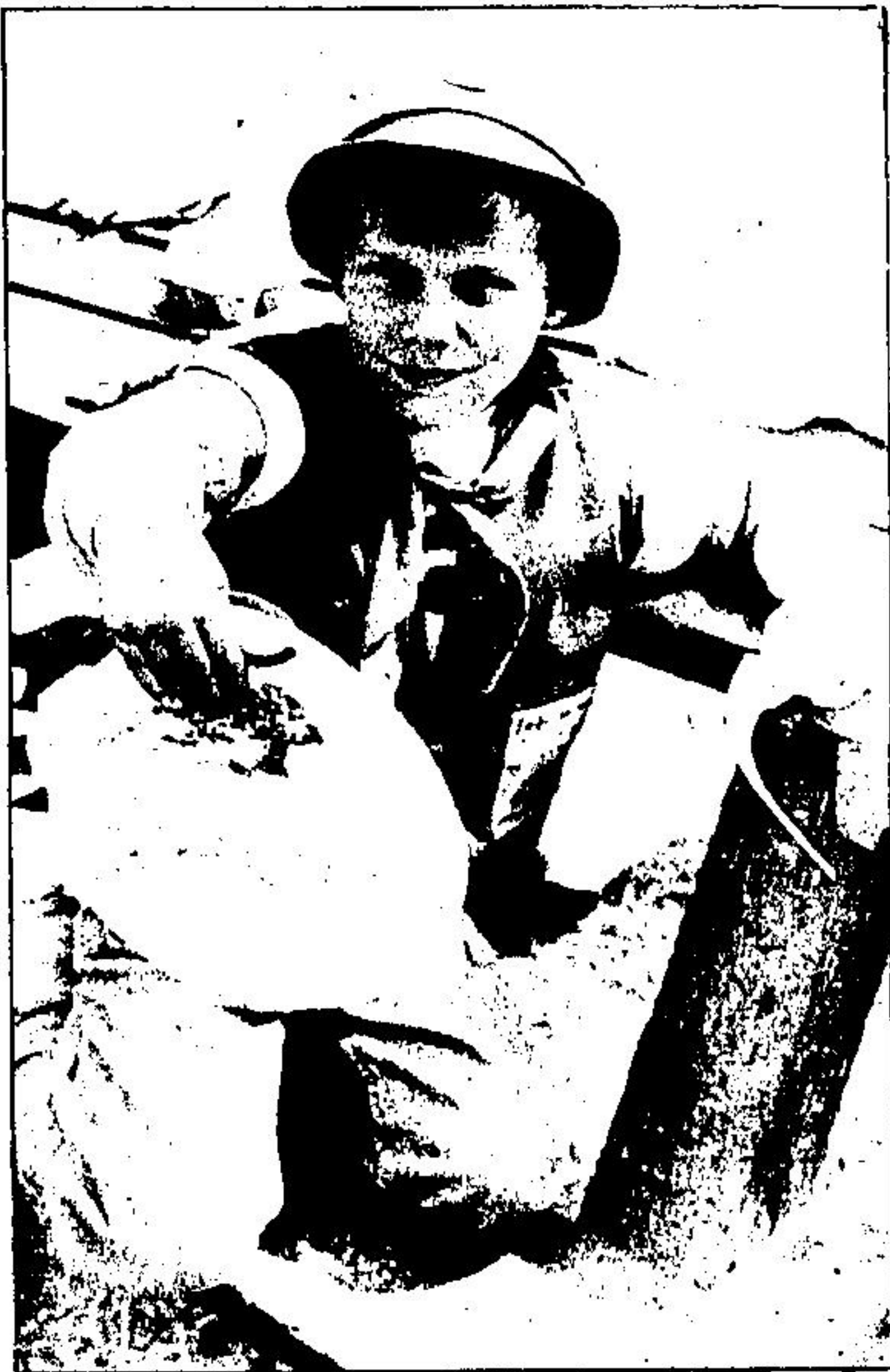
This young Beaver proudly displays the craft he made while attending the second annual Beaver Camp recently at the Blue Springs Scout Reserve.