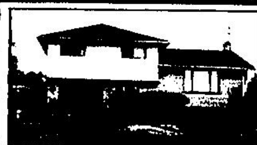
SUPER 5 ACRE MINI RANCH $249,900