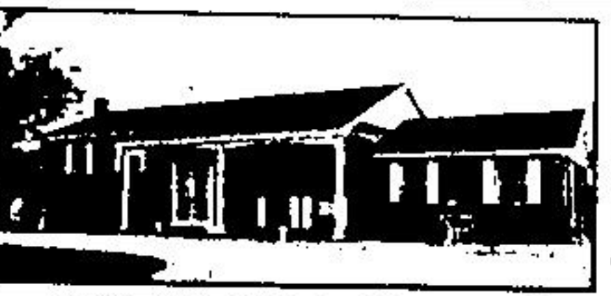
CUSTOM BUILT COUNTRY BUNGALOW — 45 ACRES $315,000