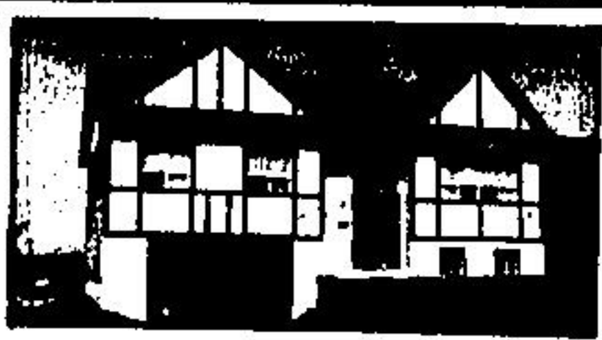
LOVELY NEW BUNGALOW $167,900