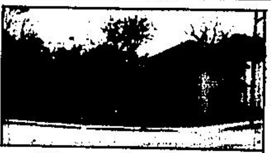
PICKET FENCE CHARM ONLY $121,900