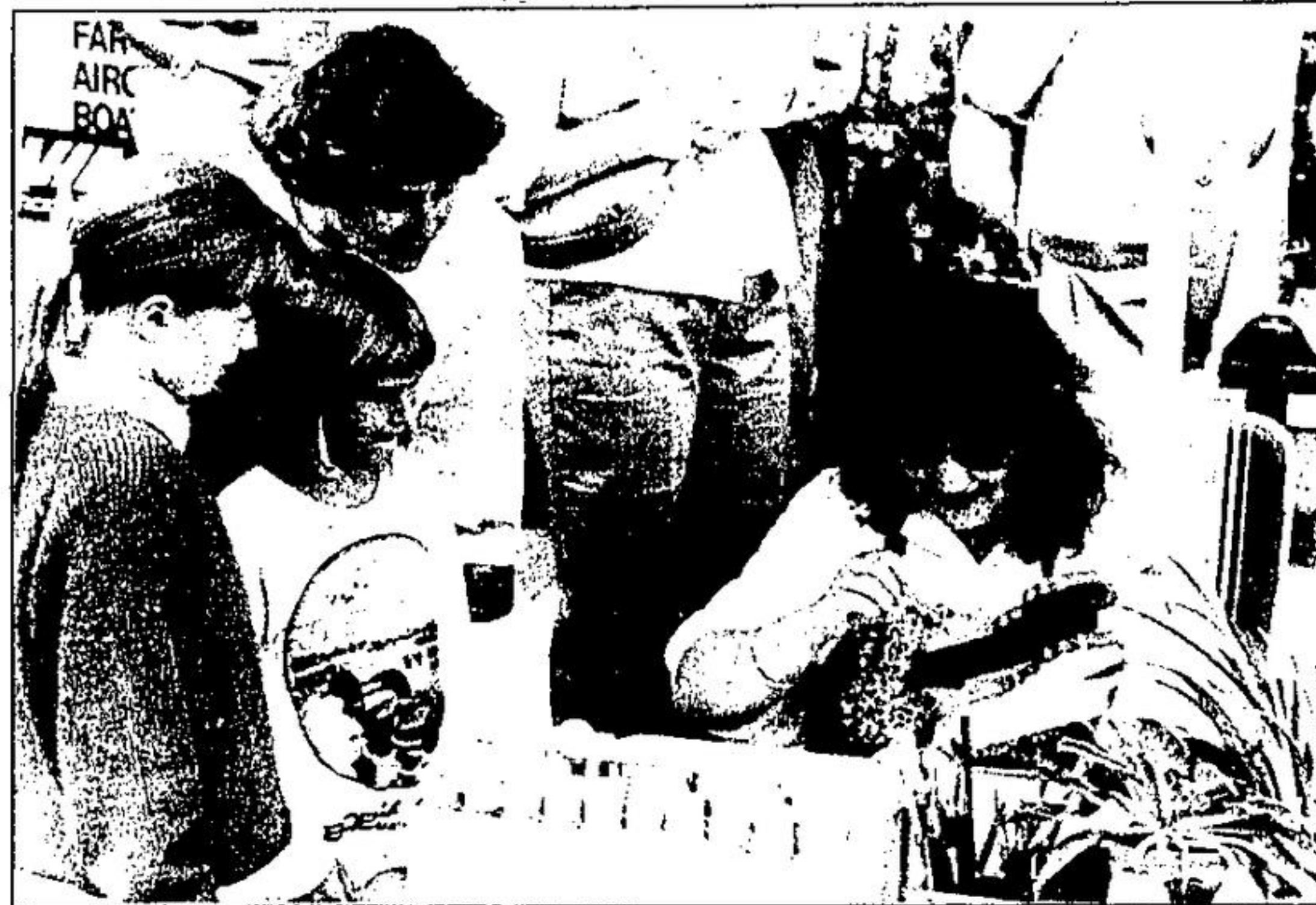
Folk art painting, presented by Whimsy's, was popular to watch for a lot of people during Pioneer Days.