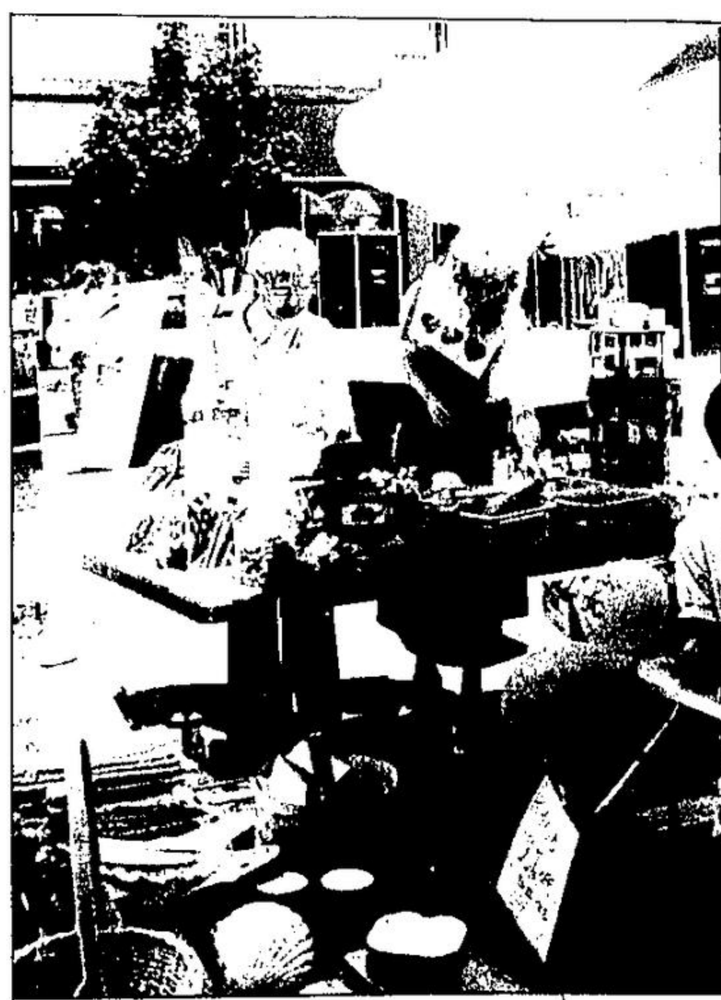
There were all kinds of bargains at Pioneer Days, as store owners look part in a sidewalk sale.