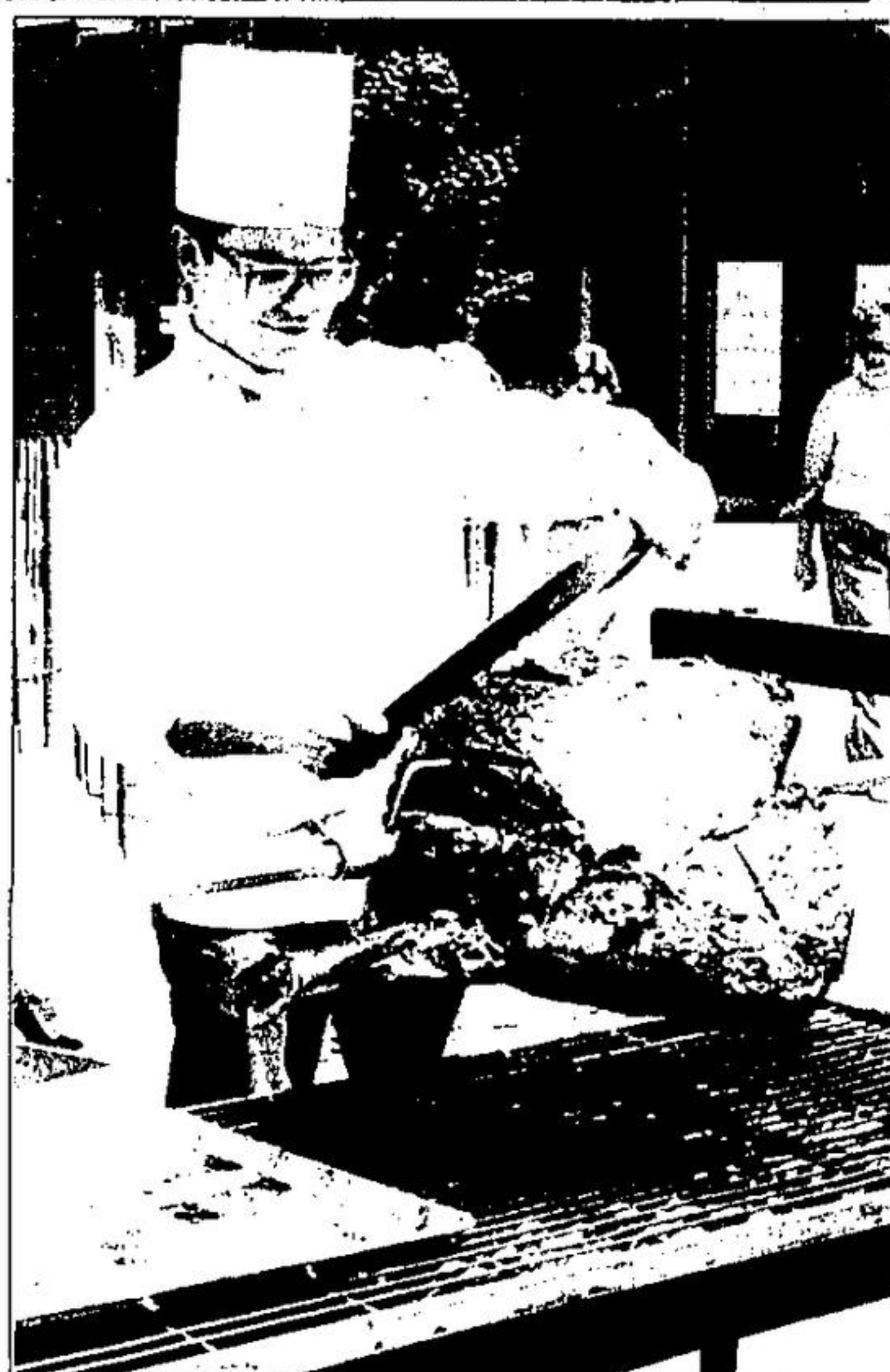
Shoppers could enjoy beef on a bun during Pioneer Days, as the Cellar Restaurant staged an outdoor barbecue, to assist the Make-a-Wish Foundation.