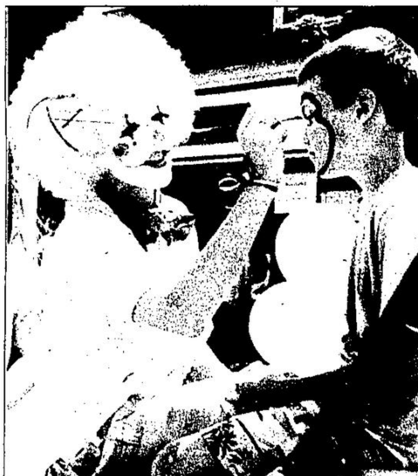
A friendly clown was included in this year's schedule for the local Pioneer Days, when she took the time to decorate young children's faces.