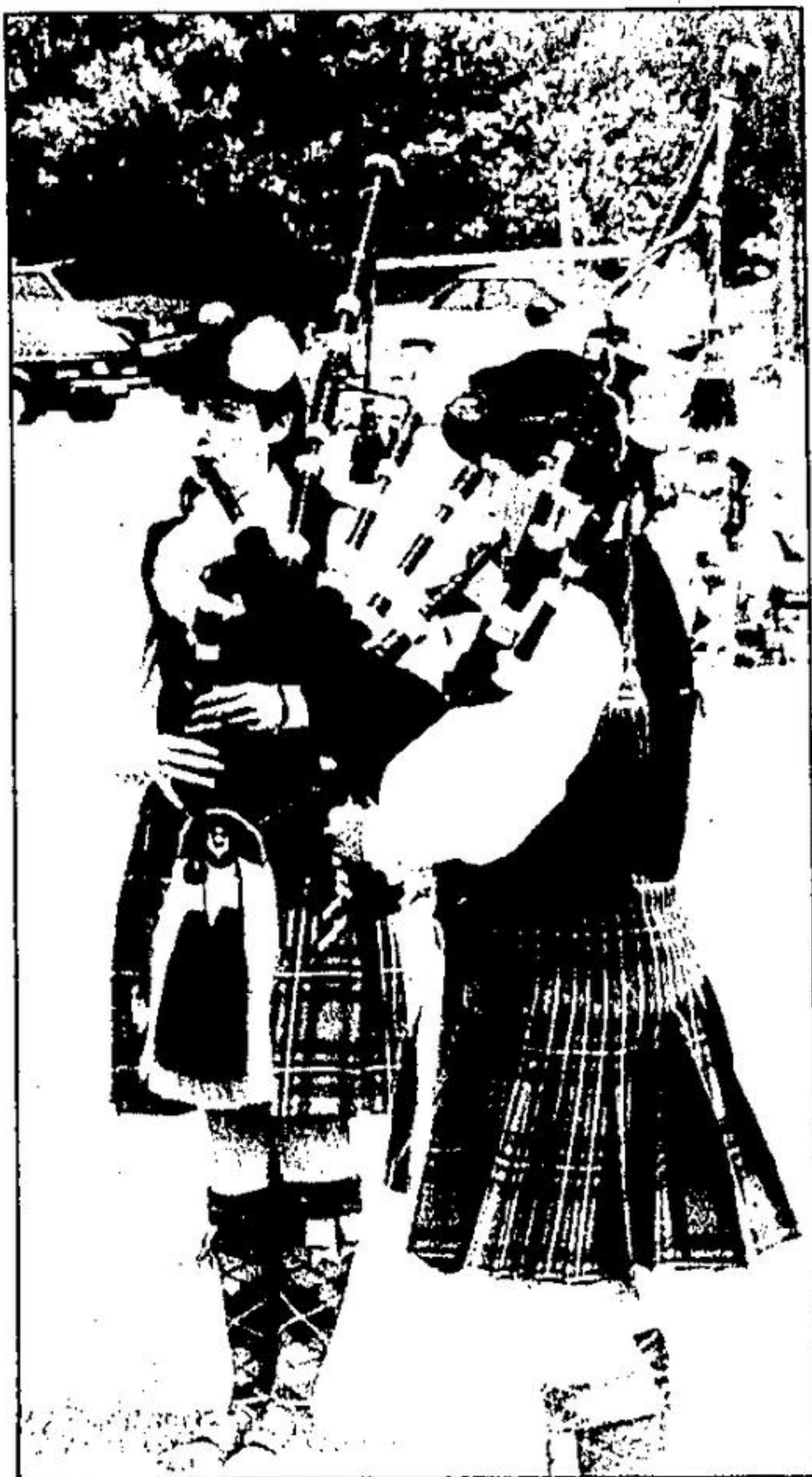
The Georgetown Girls Pipe Band took part in the competitions of the Highland Games, competing in Grade 4, against