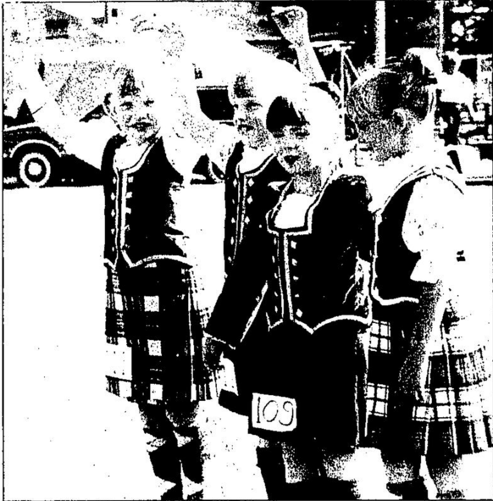
Highland dancers came in all sizes Saturday when Georgetown hosted the 13th Annual Highland Games. These youngsters were nervously going over their routines before having to take the stage and come under the critical eye of the judge in their respective events.