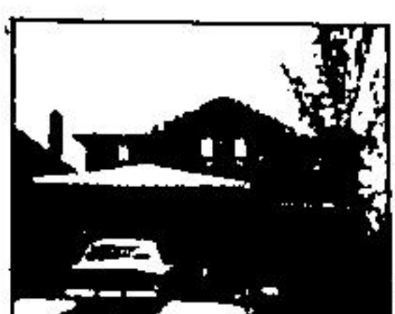
BRAMPTON BEAUTY FOR THE UPWARDLY MOBILE

This former Camera Shop is now for sale in Acton at $121,900.