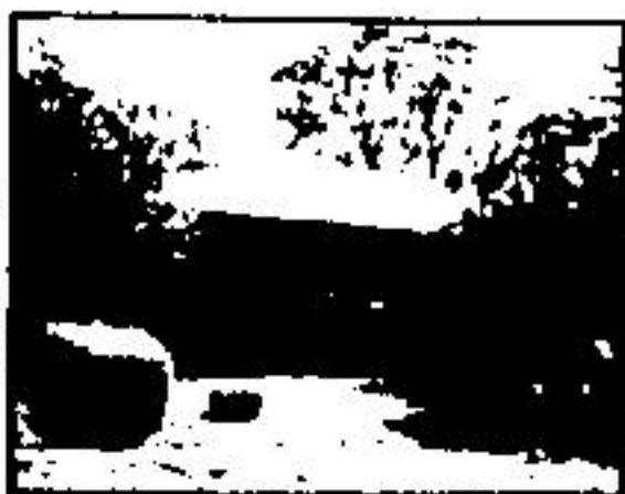
A BEAUTIFUL GARDEN IN GEORGETOWN

is only one of the many features of this 3 bedroom bungalow with all hardwood floors and finished rec room. $169,900.