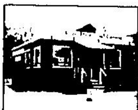
STARTING A BUSINESS?

is only one of the many features of this 3 bedroom bungalow with all hardwood floors and finished rec room. $169,900.