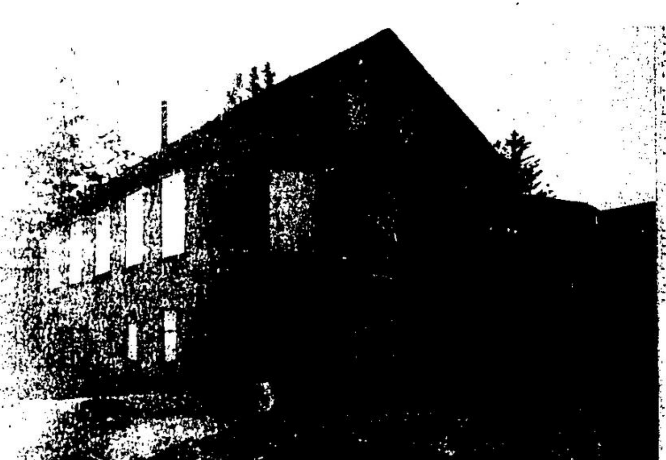
A grant from the Ministry of Culture and Communications, under the Heritage Act, has helped with restoration work to this heritage building in Glen Williams.