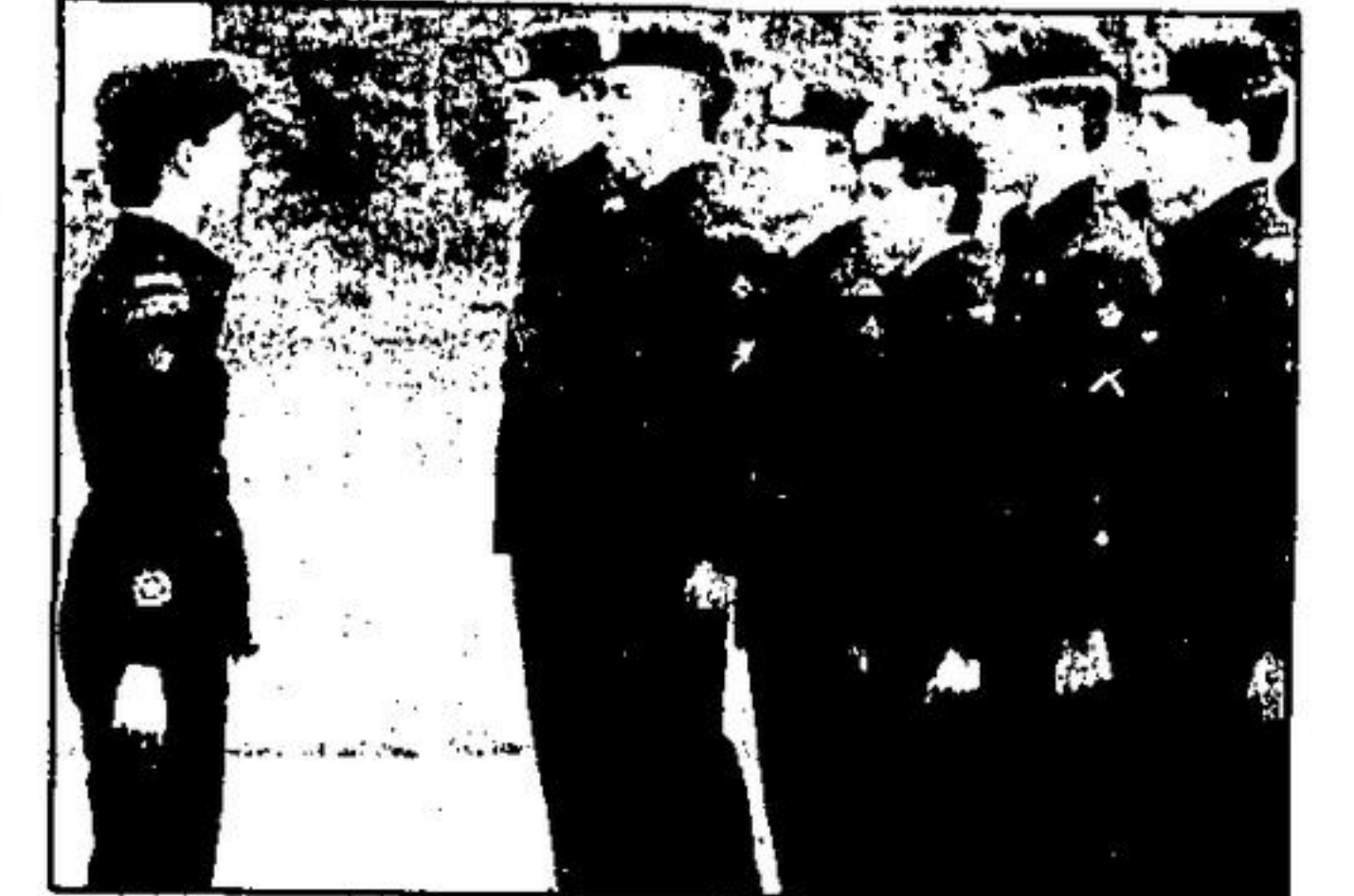
An inspection of the 676 Lorne Scots Army Cadets was carried out at the Armory grounds last Wednesday. Included in the evening's program was a demonstration by the cadets, and the traditional march-by of the ranks. This was the 15th annual inspection of the 676 Lorne Scots.