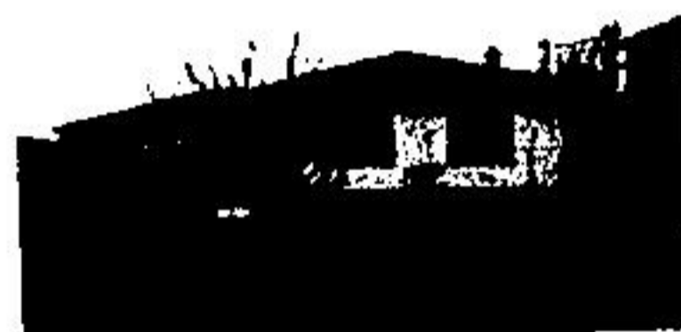
POPULAR "CARDINAL" MODEL

Immaculate 3 bedroom bungalow in prestigious crescent location. Downstairs has 1 bedroom, 1 full bathroom, workshop and gorgeous, bright recreation room. Call Marvyn Morgan 853-2074 now