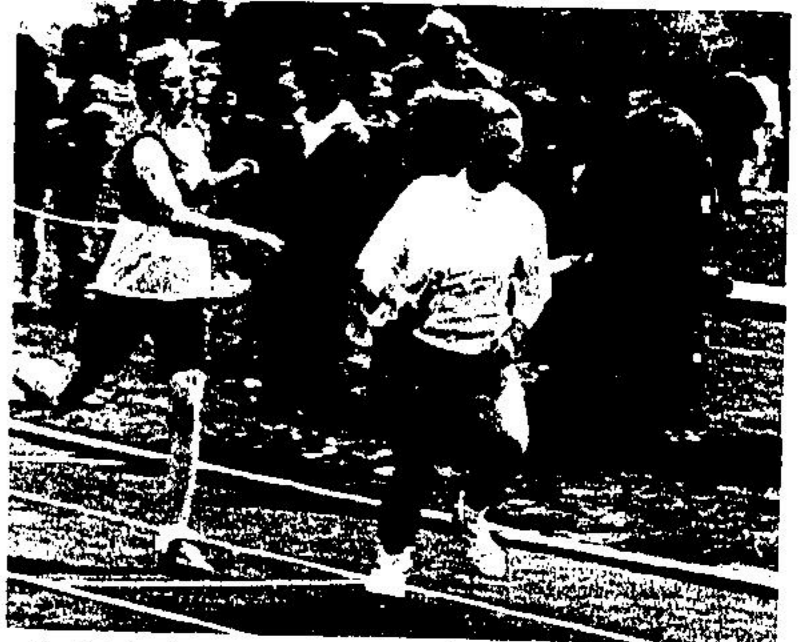
The Rebel Relays were hosted at the GDHS track last week, and a special part of the day was a ribbon cutting ceremony to officially open the facility. Here, runners pass the baton in one of the events.

That's all for this week, but remember, "No matter what your faith, God's last name is not damnit."