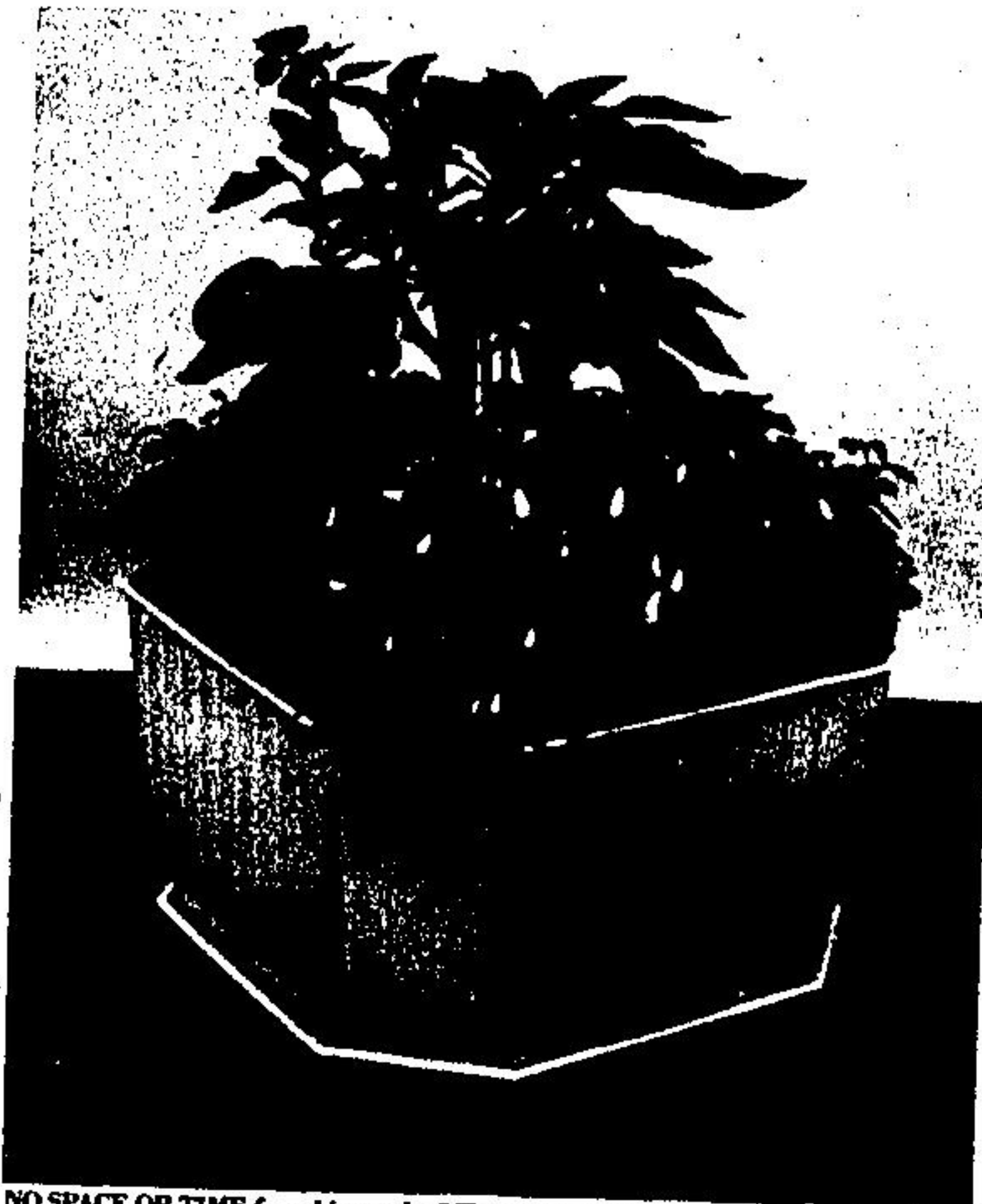
NO SPACE OR TIME for a big garden? Try container gardening. You can even grow tomato plants, cucumbers or peppers, as shown. The built-in wicking system on this product by Rubbermaid draws water from a one-gallon reservoir to minimize the need for frequent watering.

You may, in fact, save enough time to take a course in arranging those fresh flowers you've grown, or preparing some wonderful recipes with the fruits of your labor.