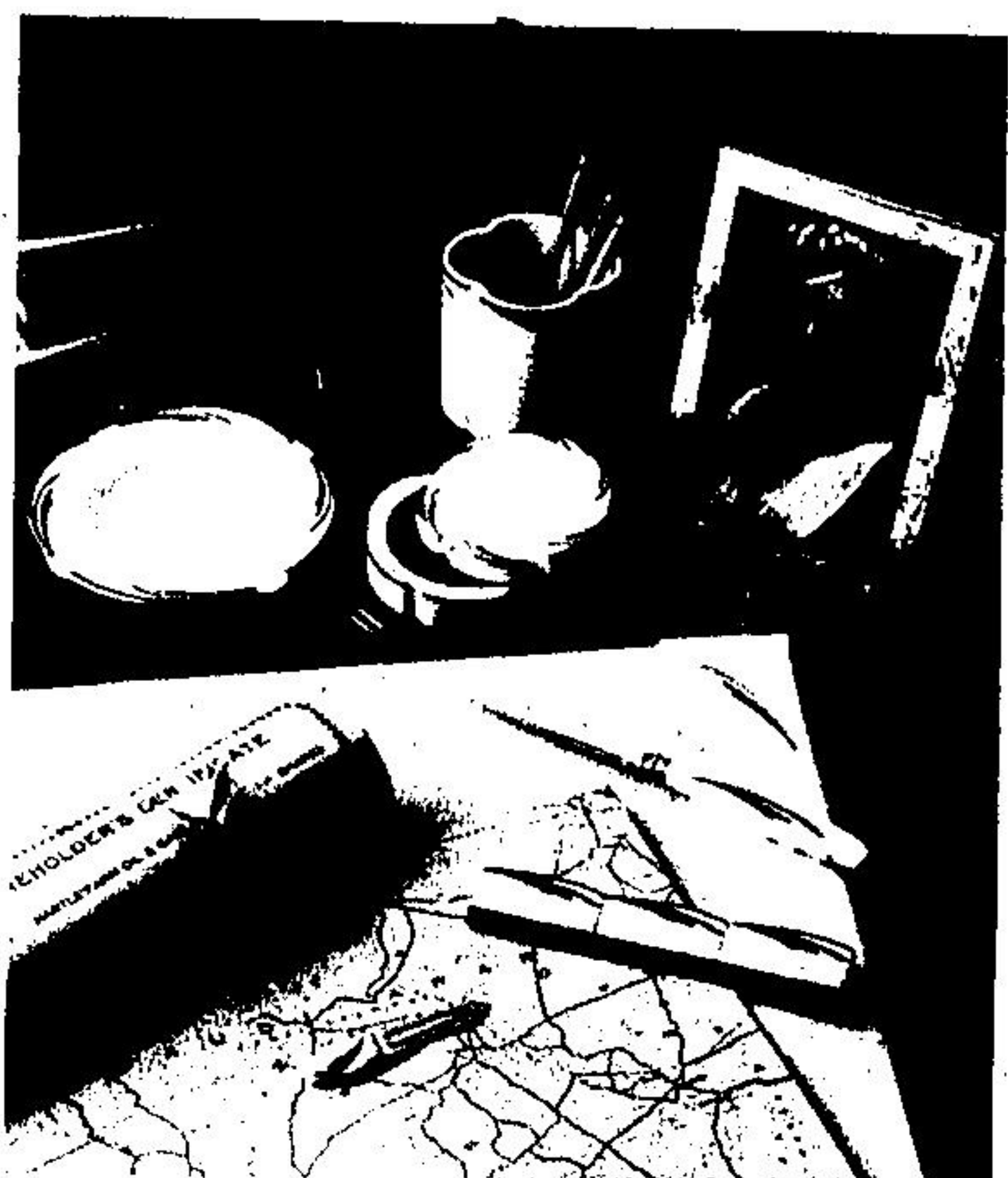
ALL THE FINER THINGS IN LIFE are beautifully practical, and what could be more attractive and practical than desk accessories made of fine china from Gorham's Dynasty Collection. Perfect for study, library, bedroom or office.

Whirlpool also covers its major appliances under its recently introduced one-year free replacement guarantee: If the consumer is not satisfied with the quality or performance of any Whirlpool brand appliance within one year from date of purchase, Whirlpool will replace it with the same or equivalent model, free of charge. Details on this offer are available at authorized Whirlpool dealers.