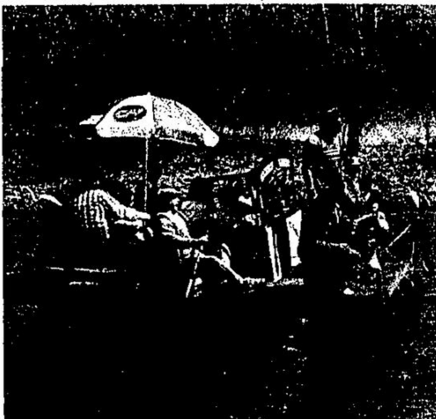
Covered with flamingos and OV umbrella. Sunny skies and temperatures of 14 Celcius greeted drinkers was 'Our Boat-Around Here'. It was a perfect day for the