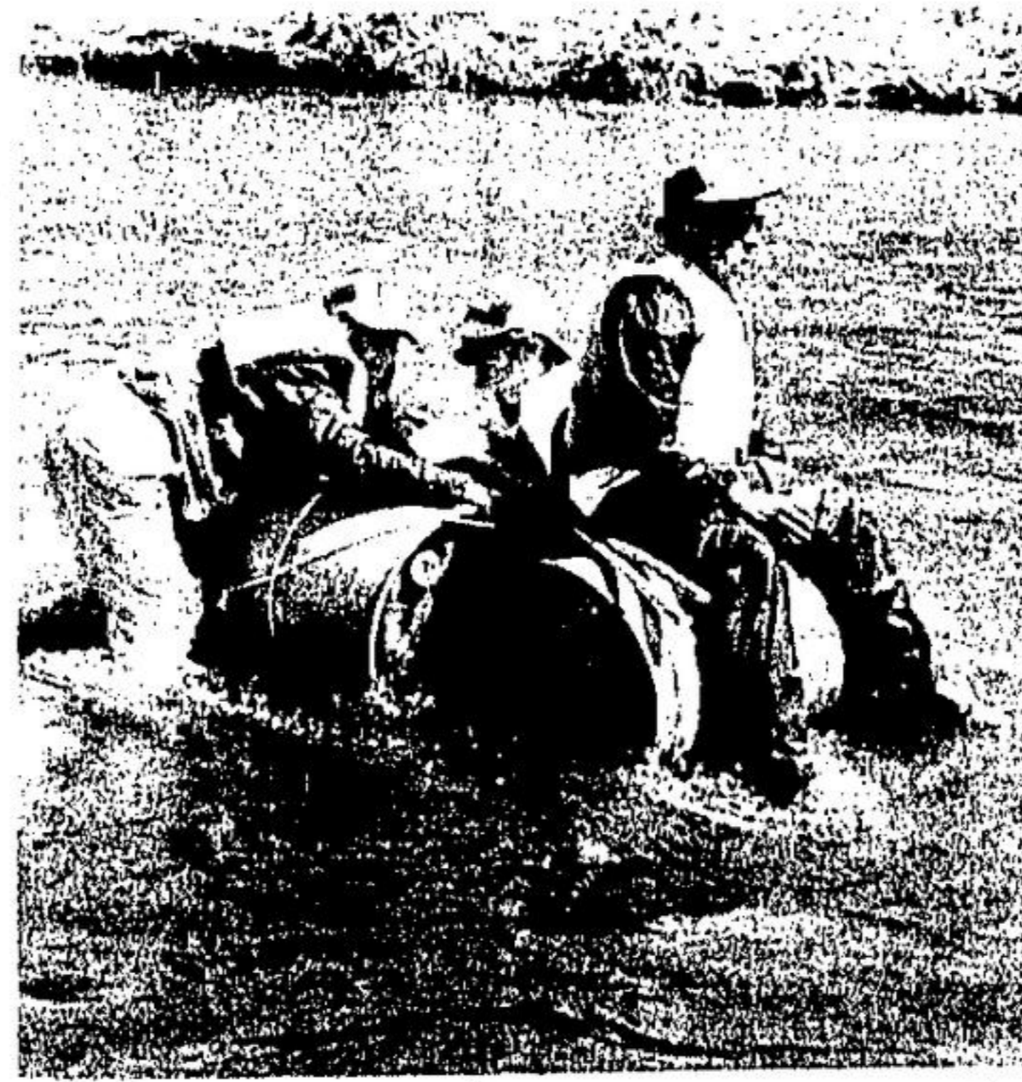
Well, someone has to be the captain. The shipmates give their navigator a hand in sending his boat down the river at Saturday's Crazy Boat Race.