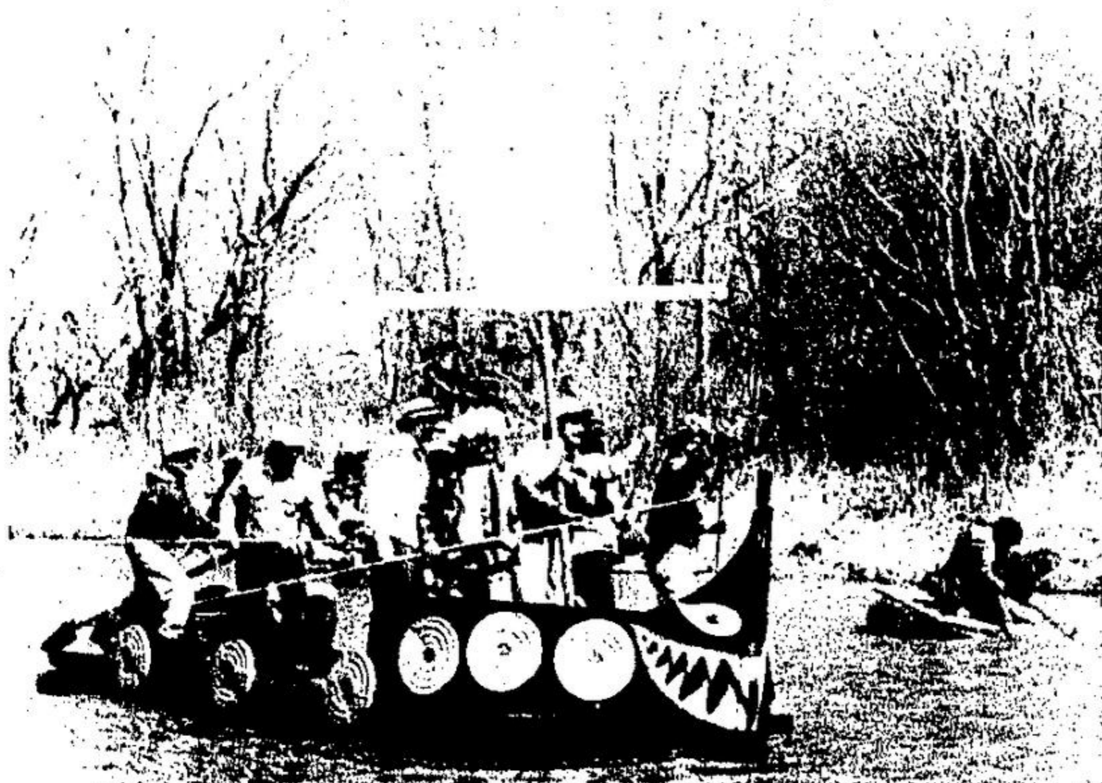
Is it a Chinese junk or a pirate ship? No matter to the rafters on the right, who obviously have more immediate concerns.