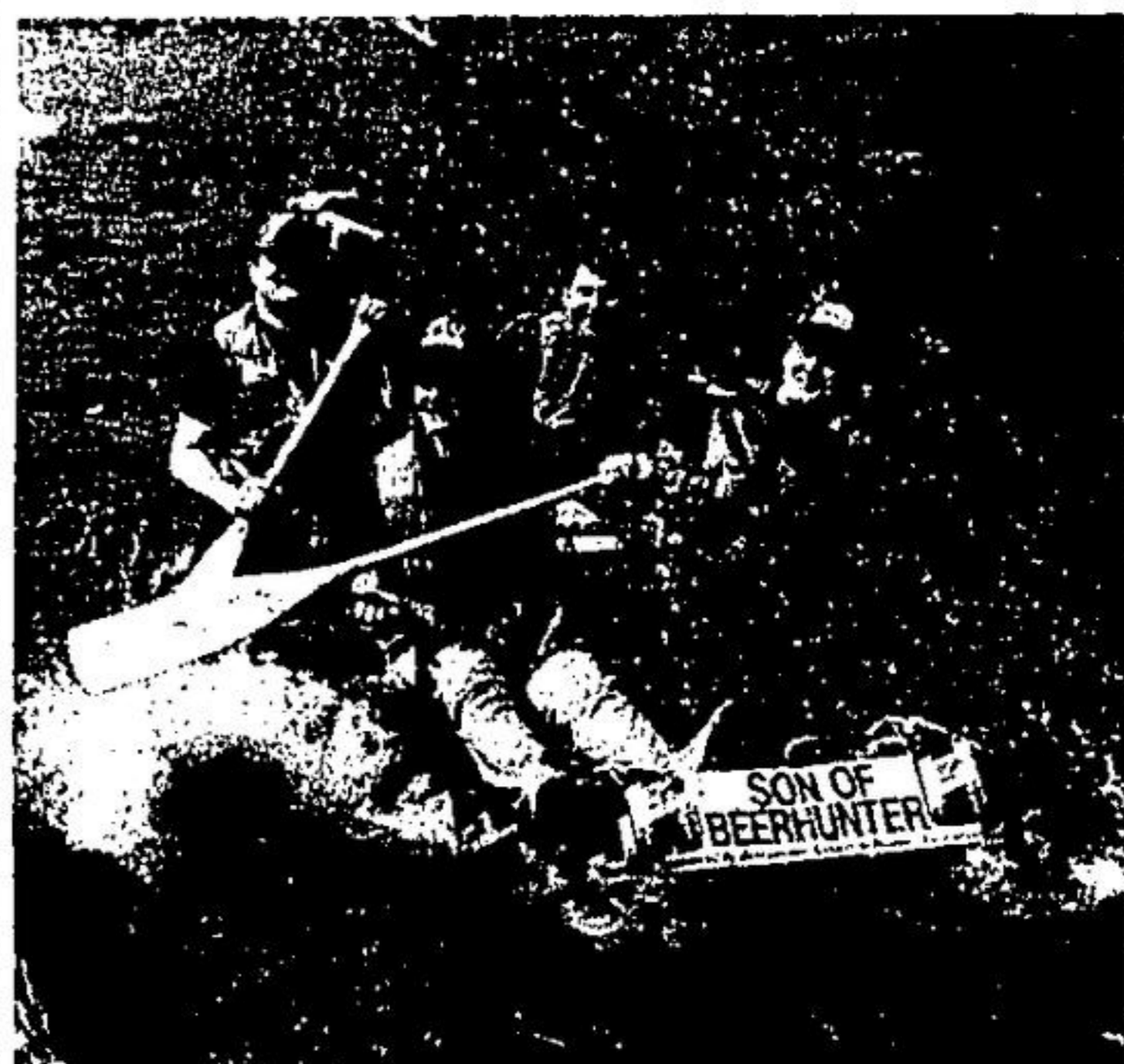
These sons of Beerhunters splashed a row of spectators as they approached the finish line. The younger members of the audience screamed 'splash us, splash us!' The boaters obliged.