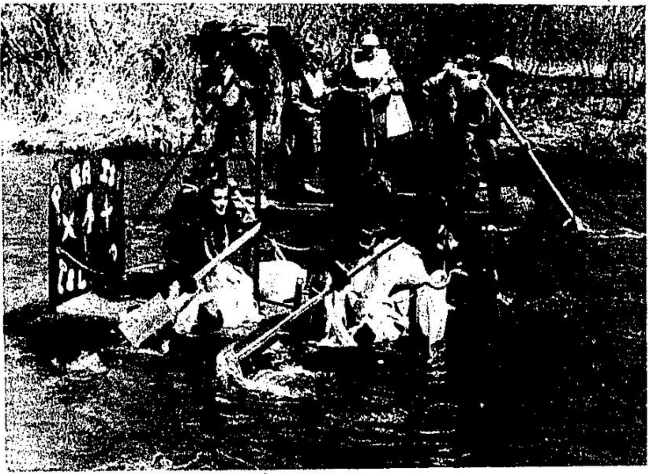
Paradise Island is disturbed by the boat approaching her side. The competition was hot and the weather was warm for Saturday's races.