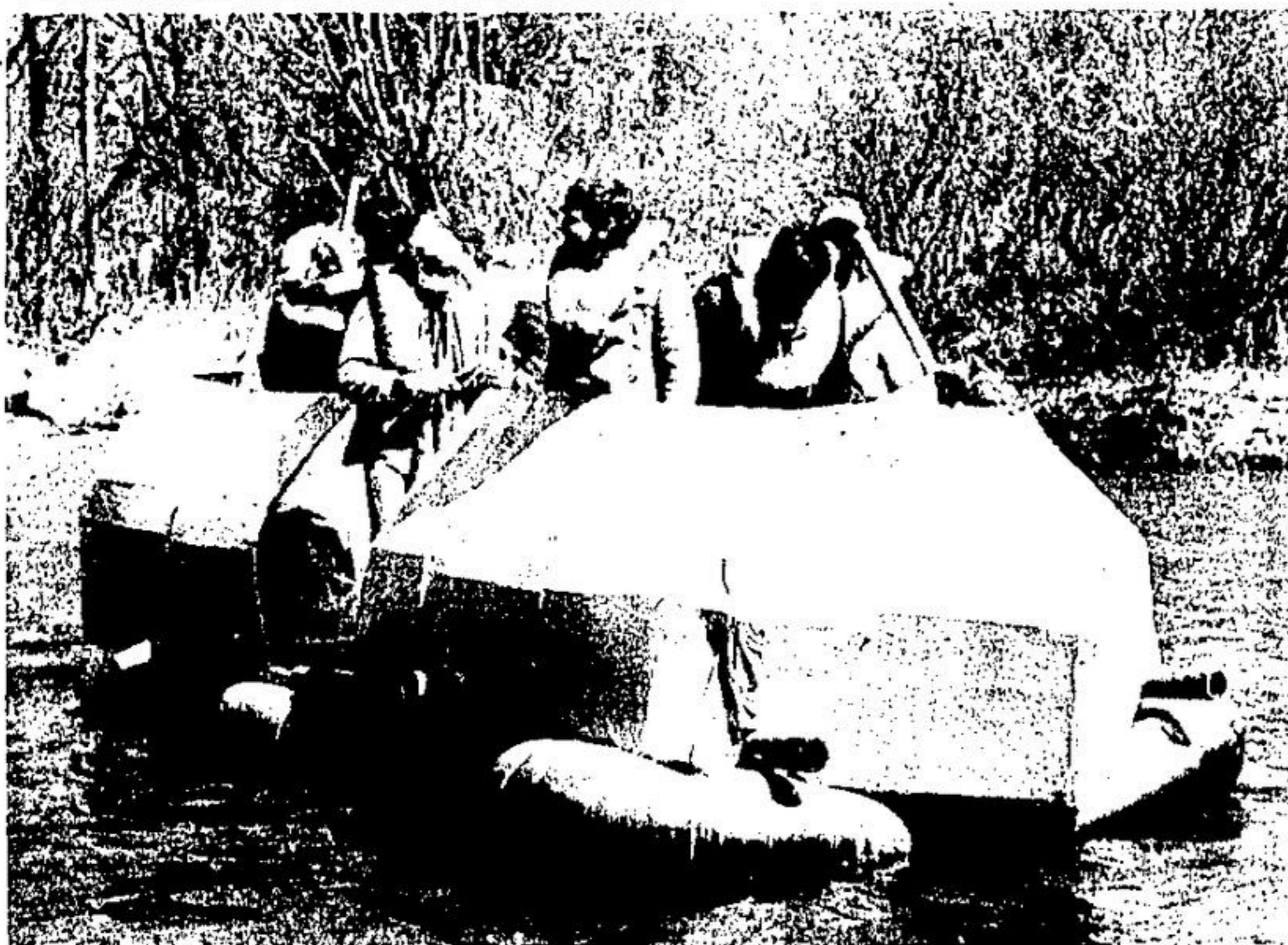
Big, awkward but still holding together was this large boat streaming down the Credit on Saturday. Spectators flanked the banks of the river to see such sights.