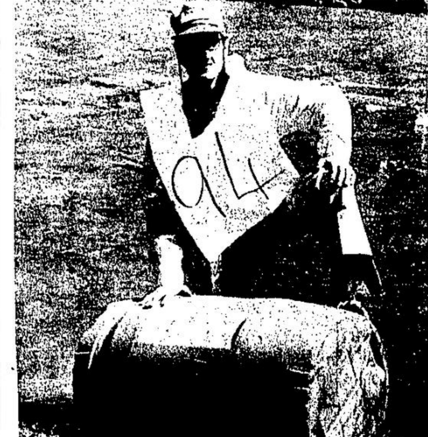
Crazy Boat Racing can be a barrel of fun - that is, if you don't lose your boat along the way. Some entrants didn't make it to the finish line.