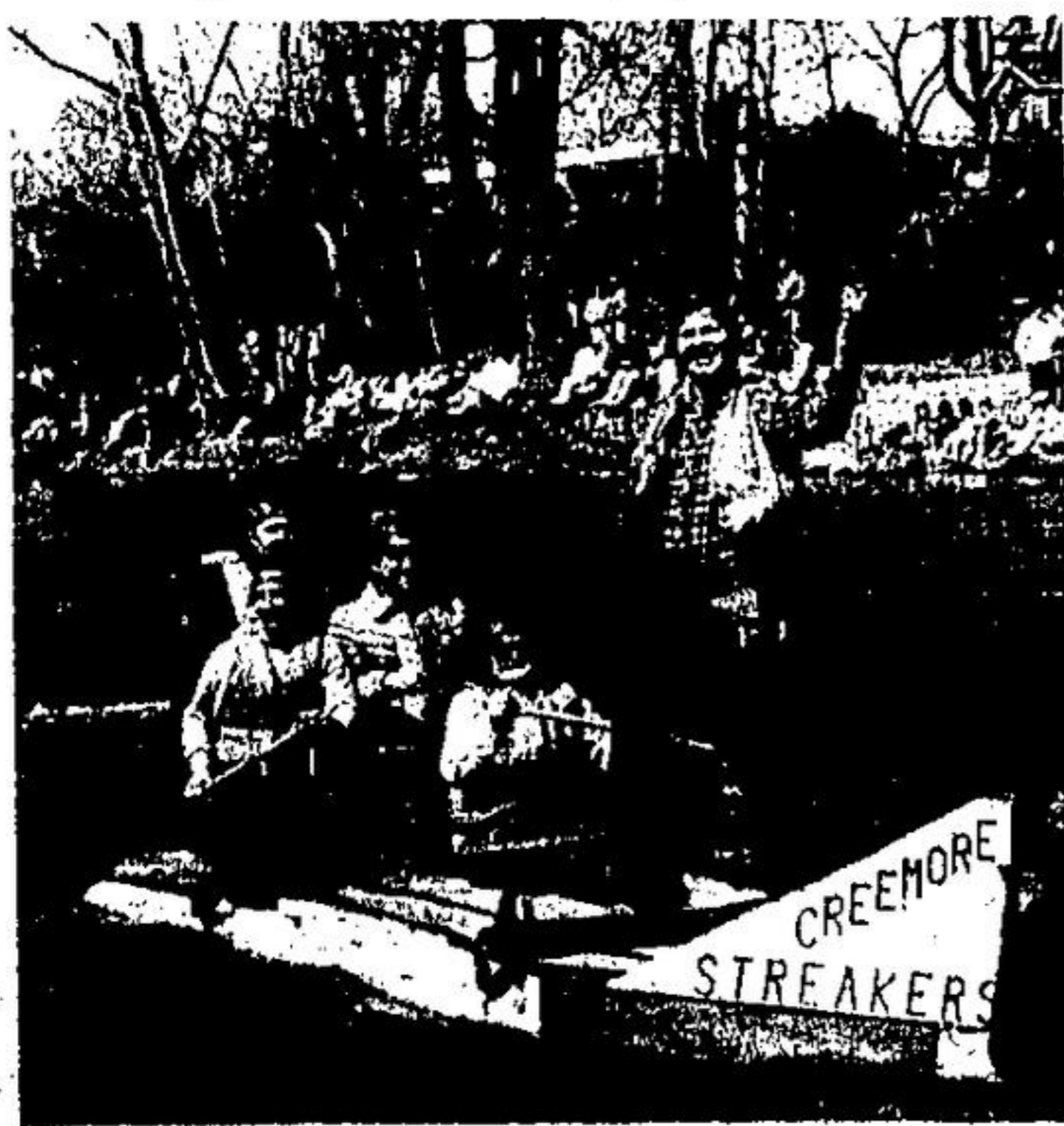
The Creemore Streakers show great balance and grace as they approach the finish line at Saturday's race. The Creemore judge gave them 9.8 for style and artistic ability.