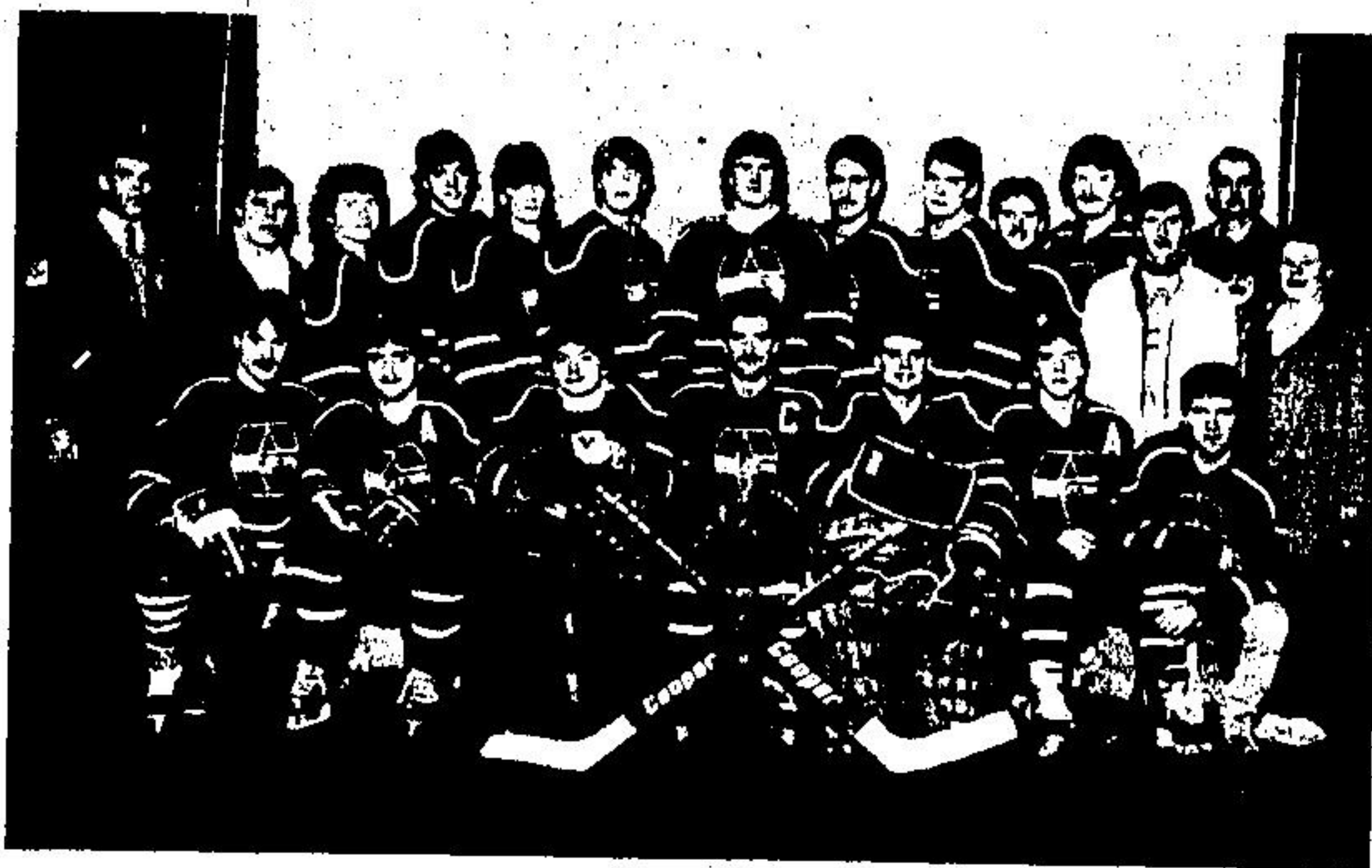
Georgetown Gemini Juveniles OMHA 'AA' Champions