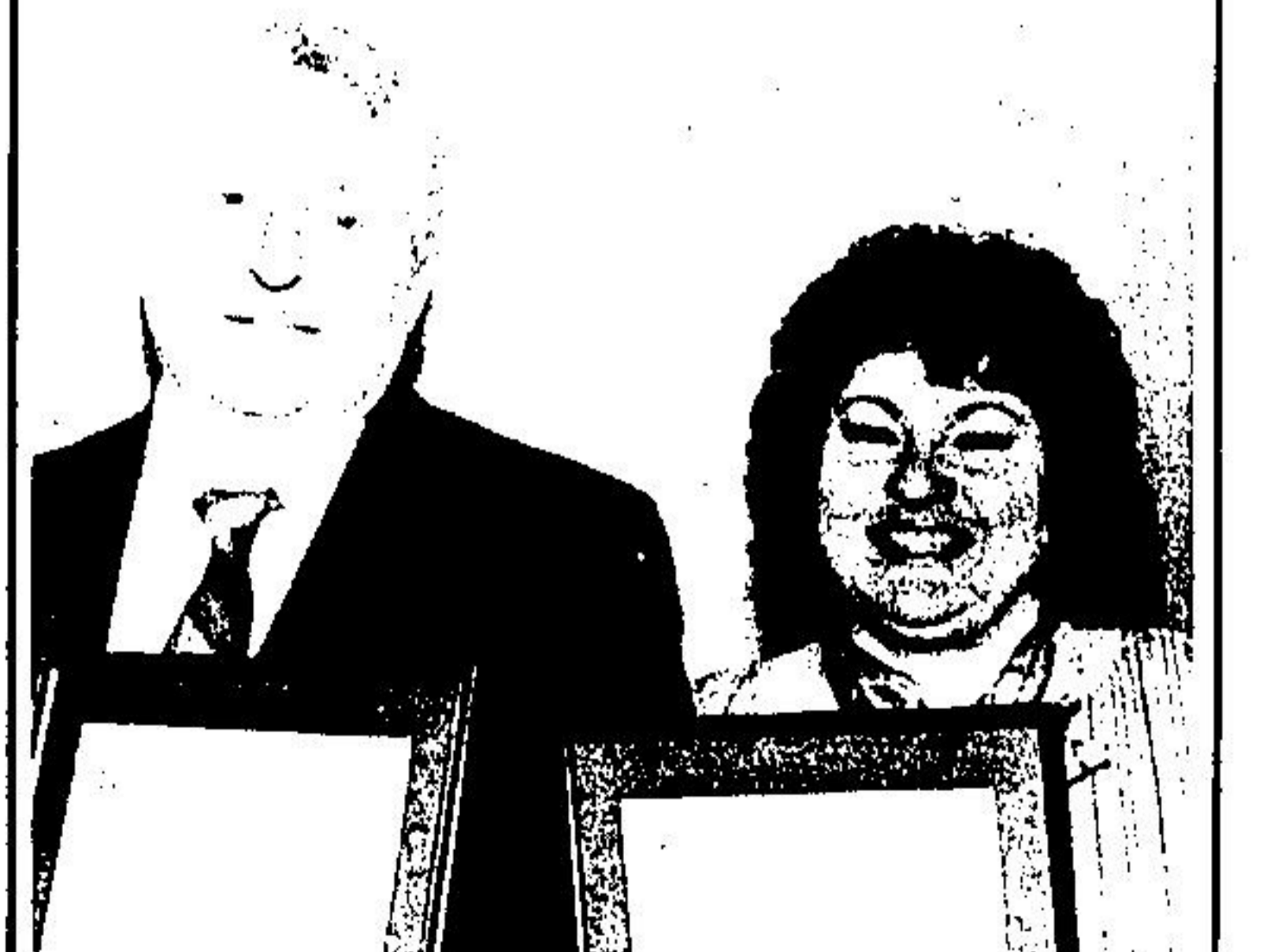
Executive members were thanked for their work in running the Gemini hockey team successfully throughout the season. Winners of the executive award for the 1987/88

GAME 7 (if necessary) Sun., April 10, 8 p.m. at Grimsby