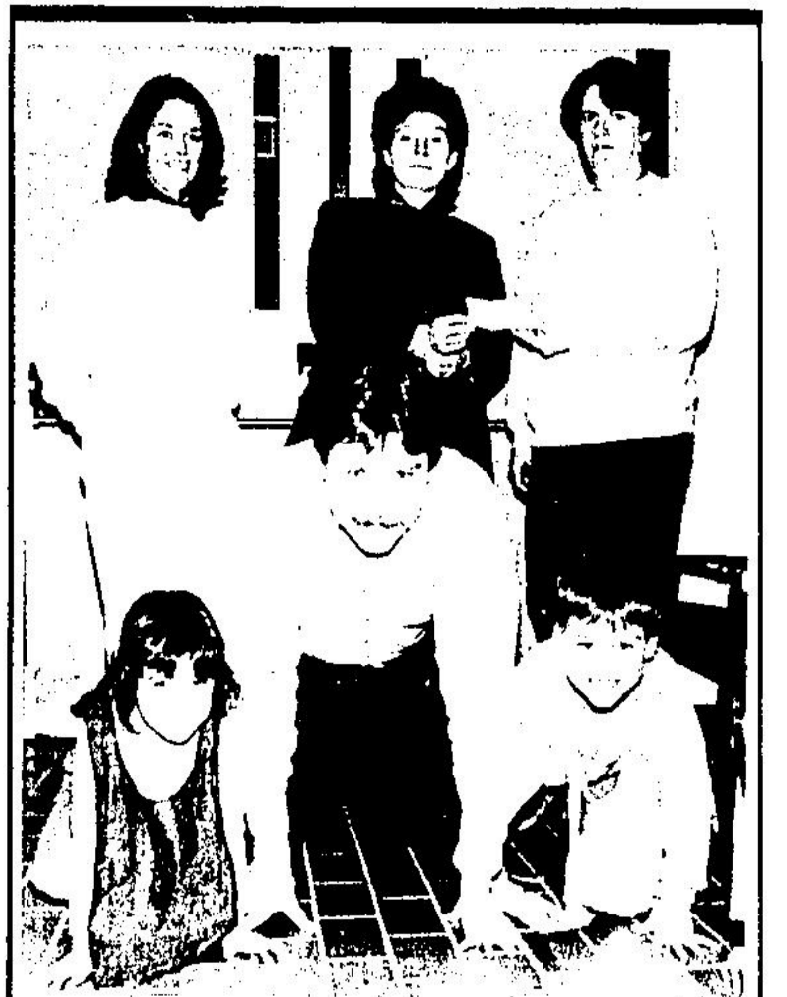
The pupils, parents and teachers of the Glen Williams Public School family have given the Georgetown District High School track and field facilities a boost. A cheque for $500 was presented to the high school at an assembly last week. Seen here are avid future members of the track and field team (from left)