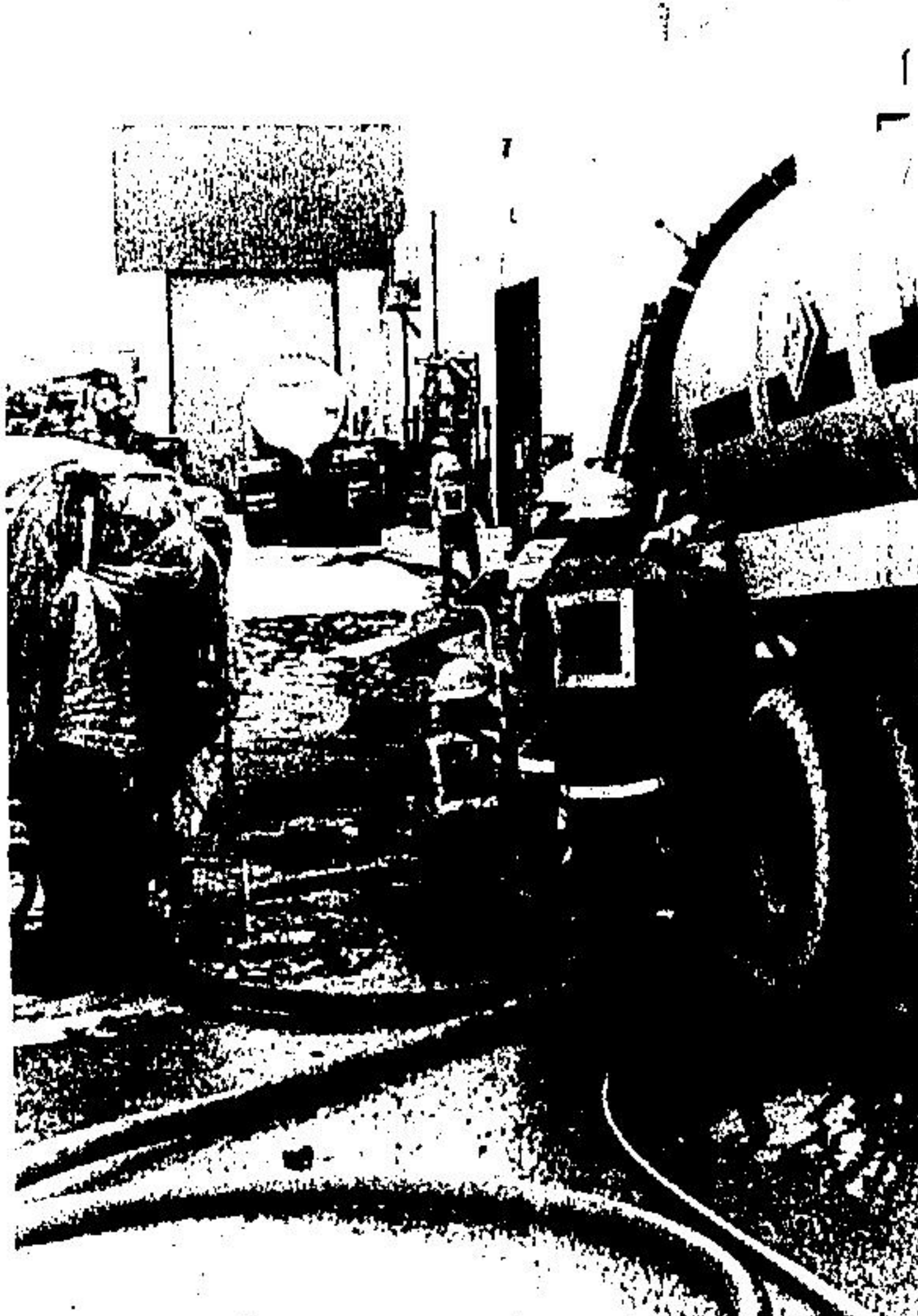
This tank containing over 5,000 gallons of Naphtha Petroleum split open when workers were unloading the combustible fuel outside Park Thermal Ltd. on Todd Road early Thursday morning. Most of the fluid leaked out of the tank and clean up crews worked for about 12 hours on the spill.