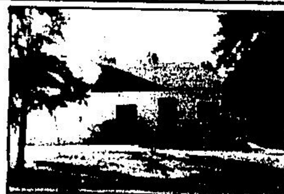
REDUCED! PRICED TO SELL