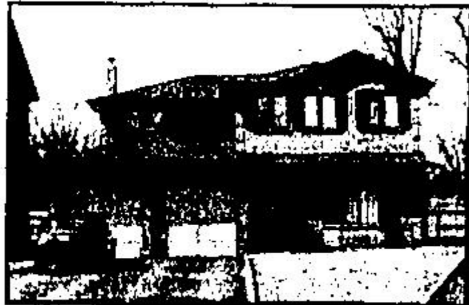
PRESTIGIOUS — PARK AREA