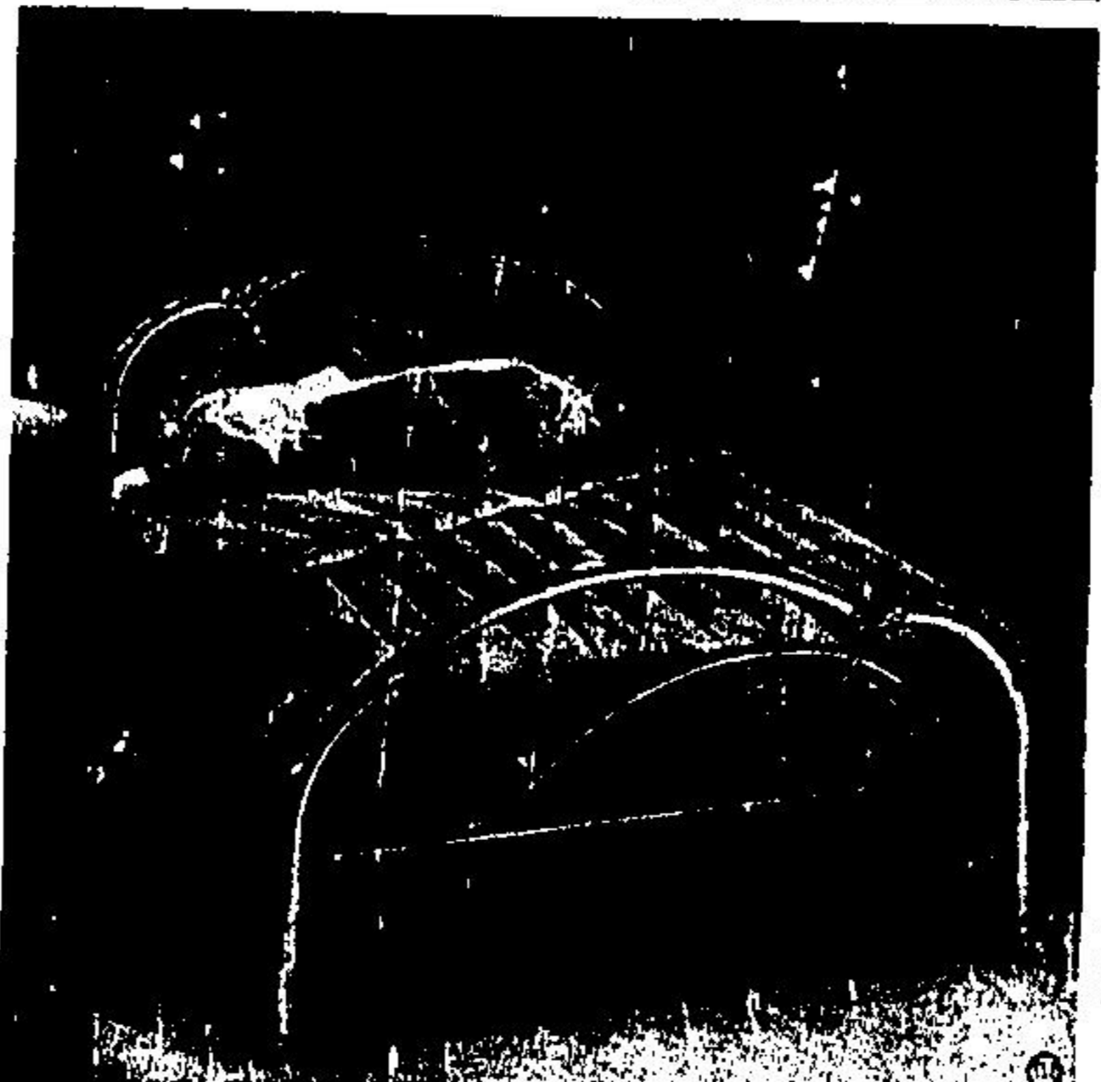
SLEEKLY CURVING BRASS , protected forever from tarnish with a baked-on finish, La Scala is one of Dresher's "new generation" contemporary brass bed designs.

But there's more to the new-look brass beds than meets the eye. Look for con-