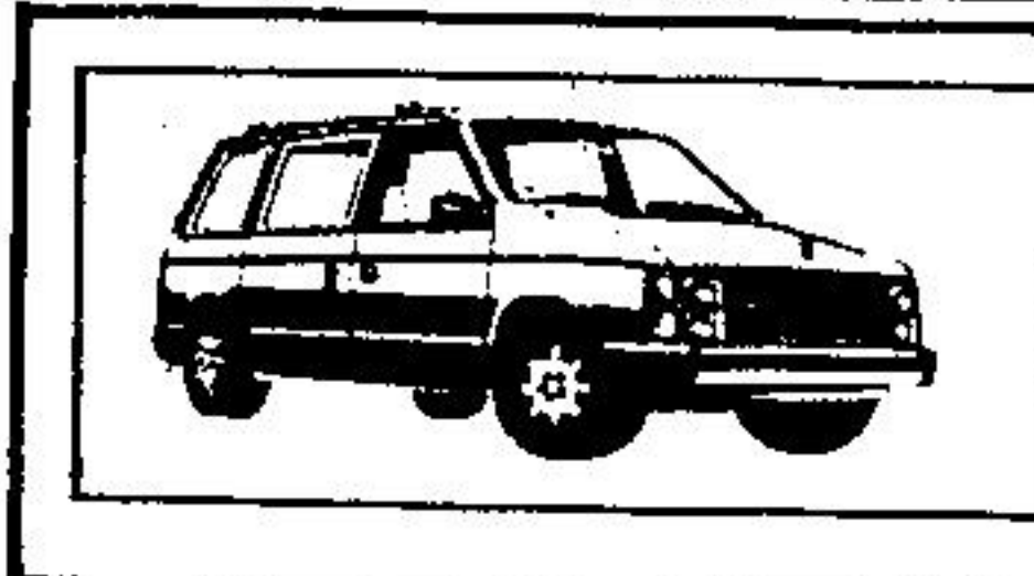
(Actual size of ad)