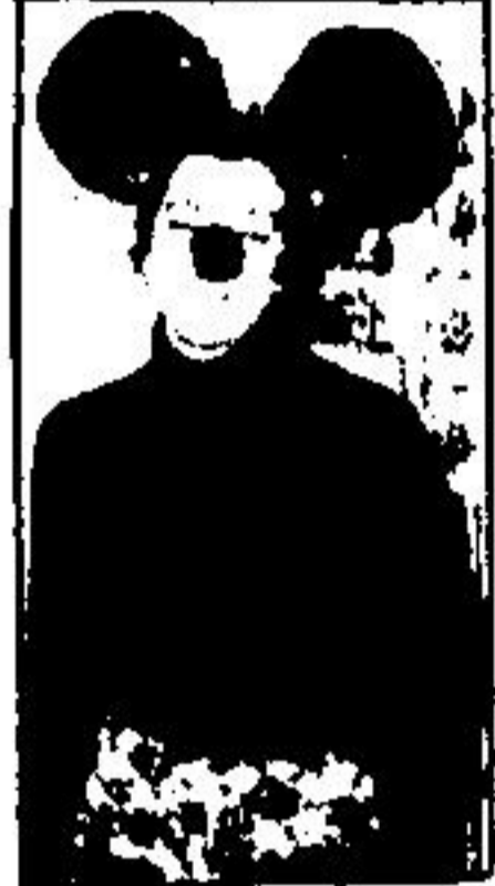
Love n xxxx Mom & Dad 15411-Na-0319