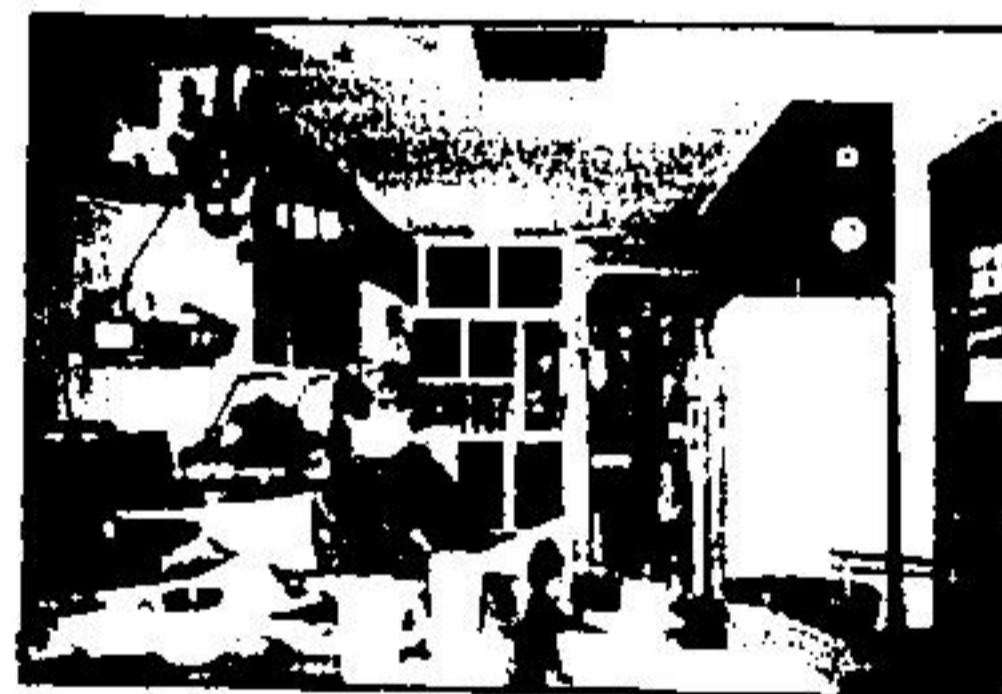
Large country kitchen