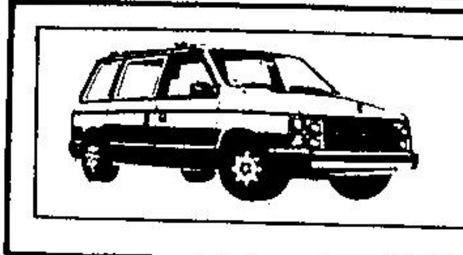
(Actual size of ad)