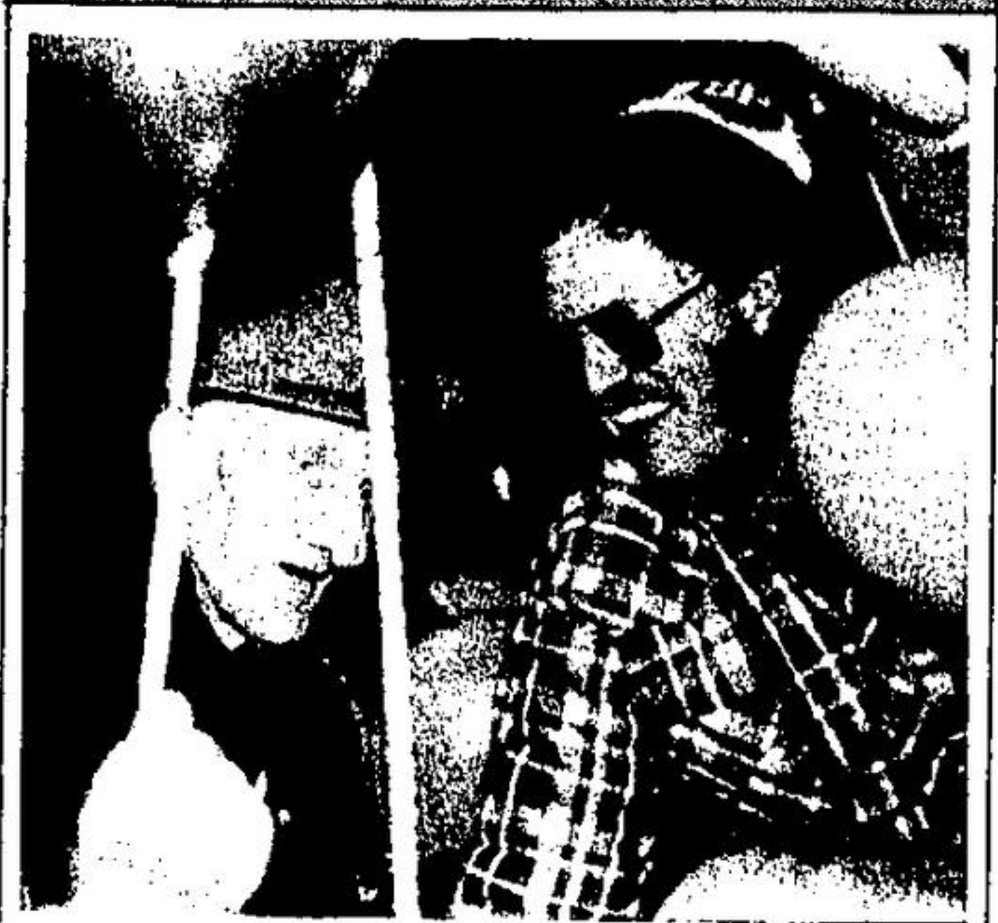
Counting down the seconds...