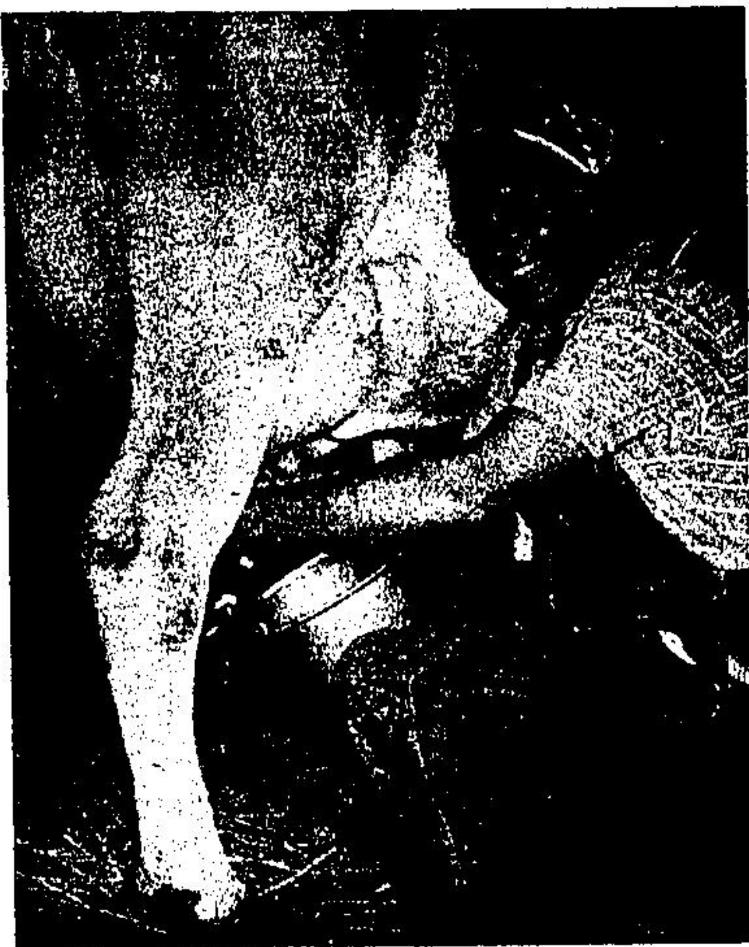
Milking the system...