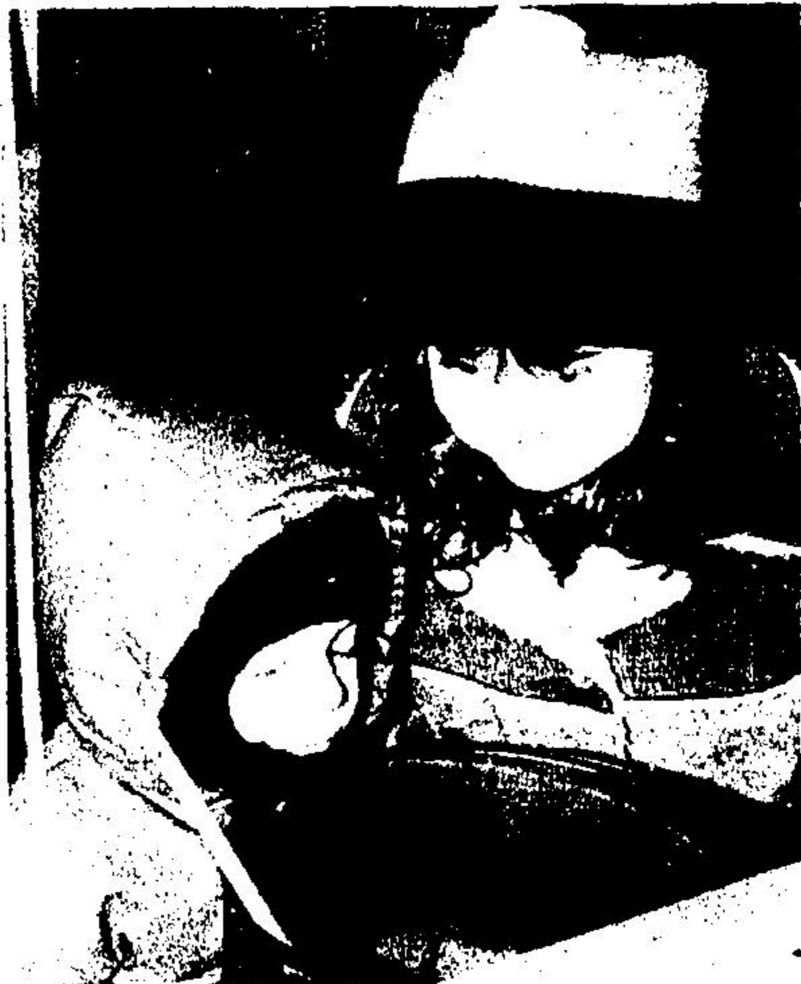
Maple syrup time...