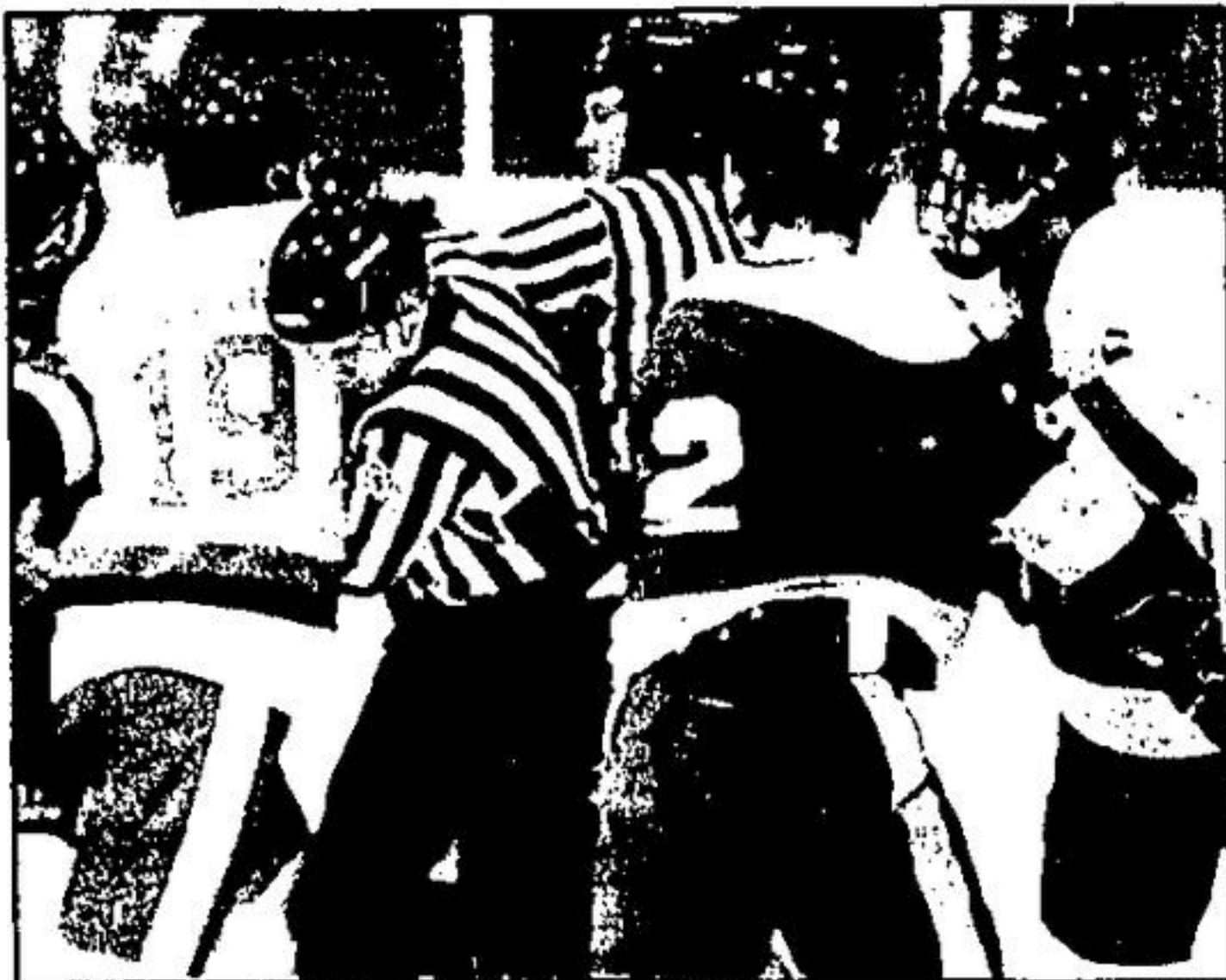
Georgetown Gemini hopes soon turned to frustration in their playoff series with the Vaughan Raiders last season, and scenes like this were

common. Though they were the hottest team heading into the playoffs, the Gems were defeated four games to one by the Raiders.