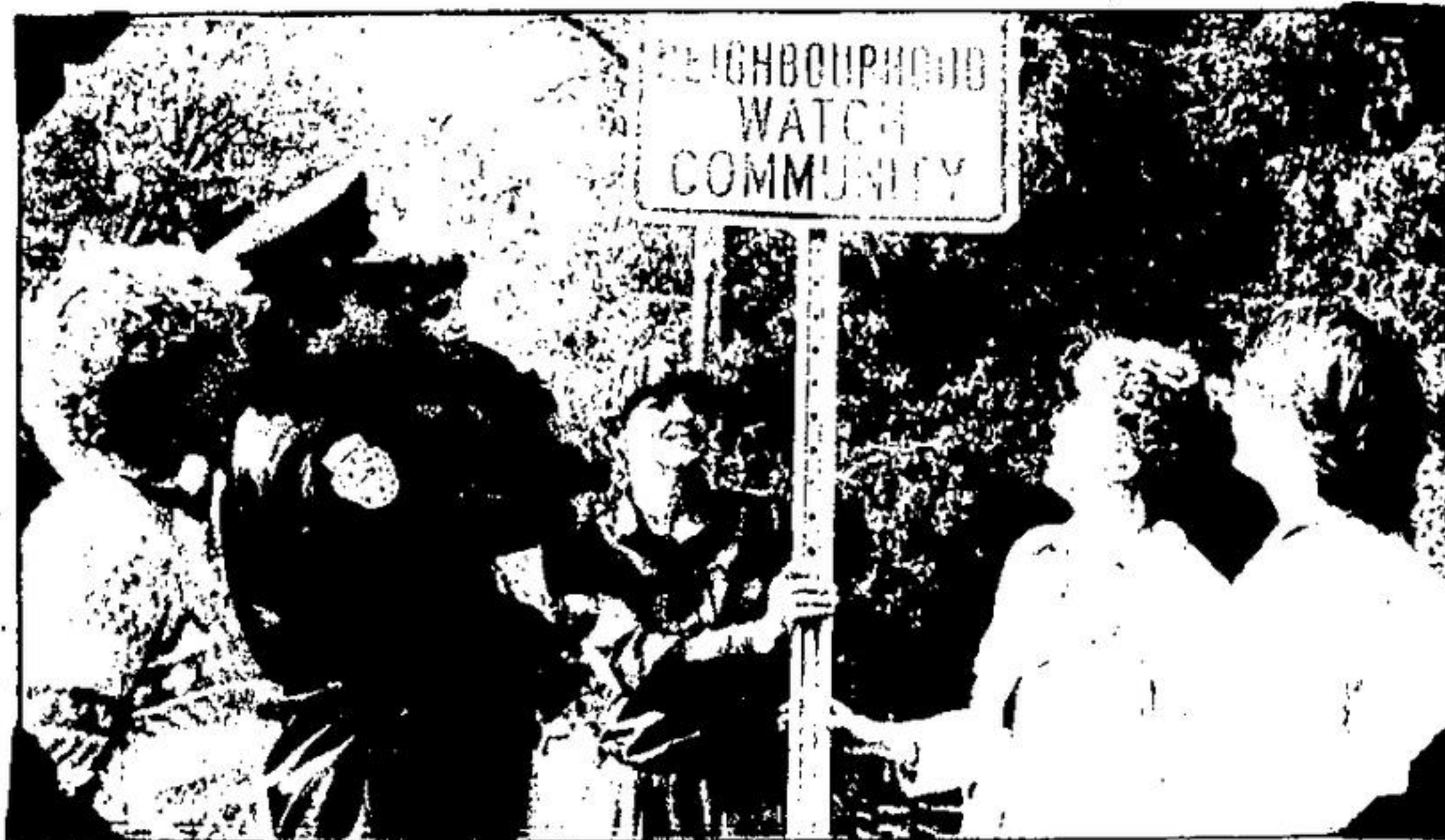
Pro-active policing ...