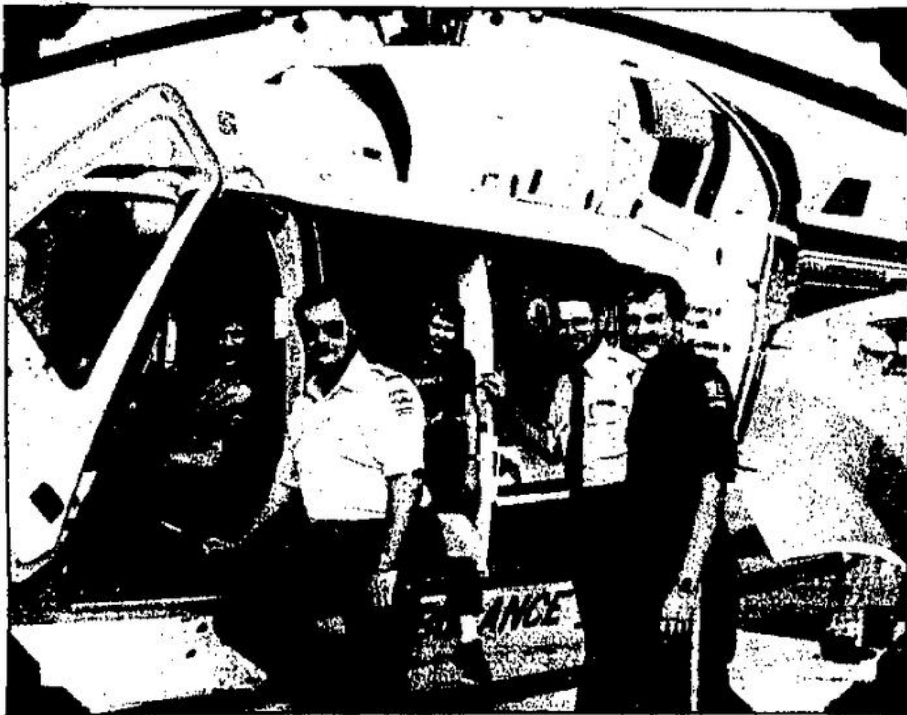
Ambulance anniversary ...