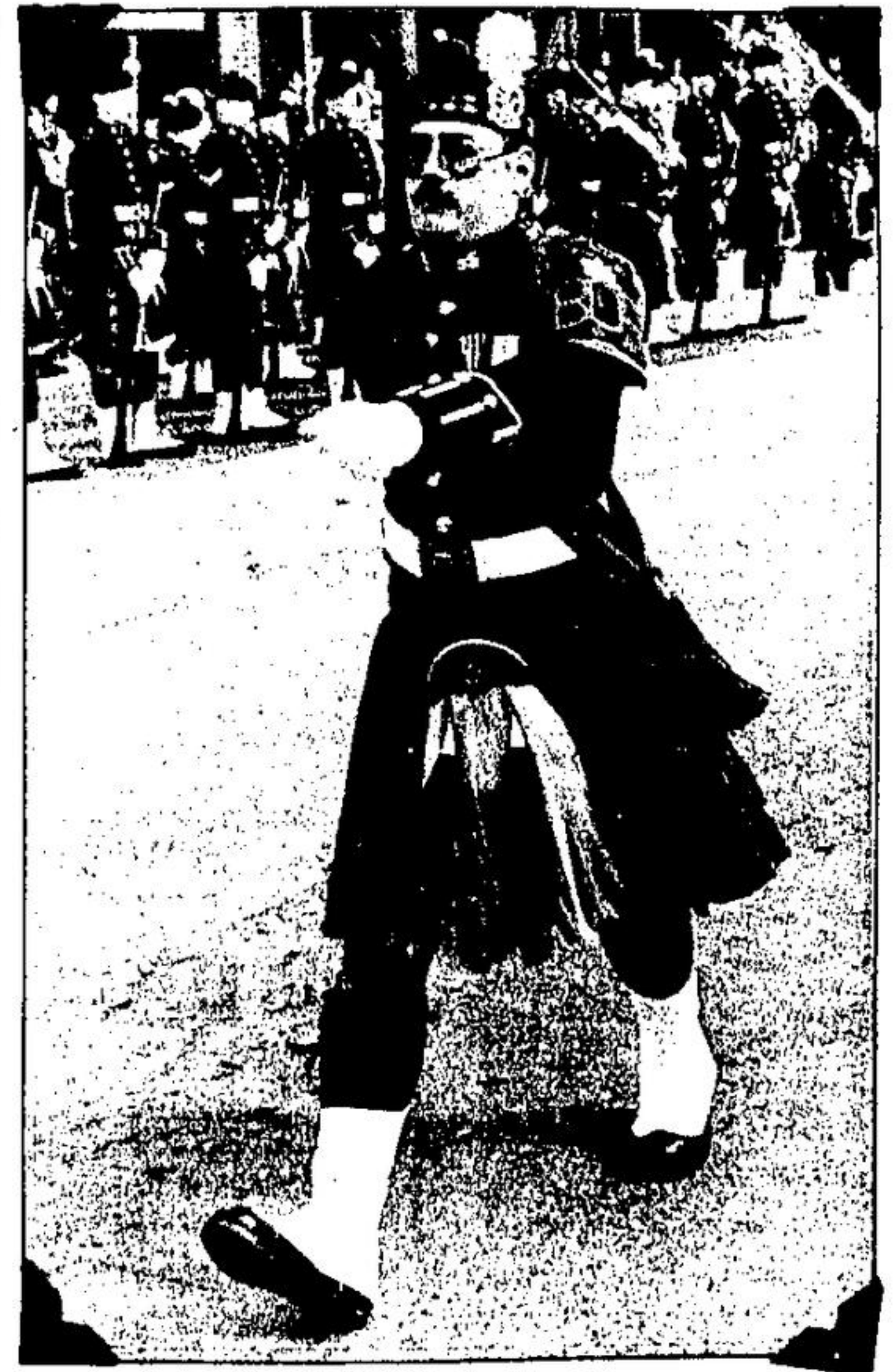
Freedom of the town ...