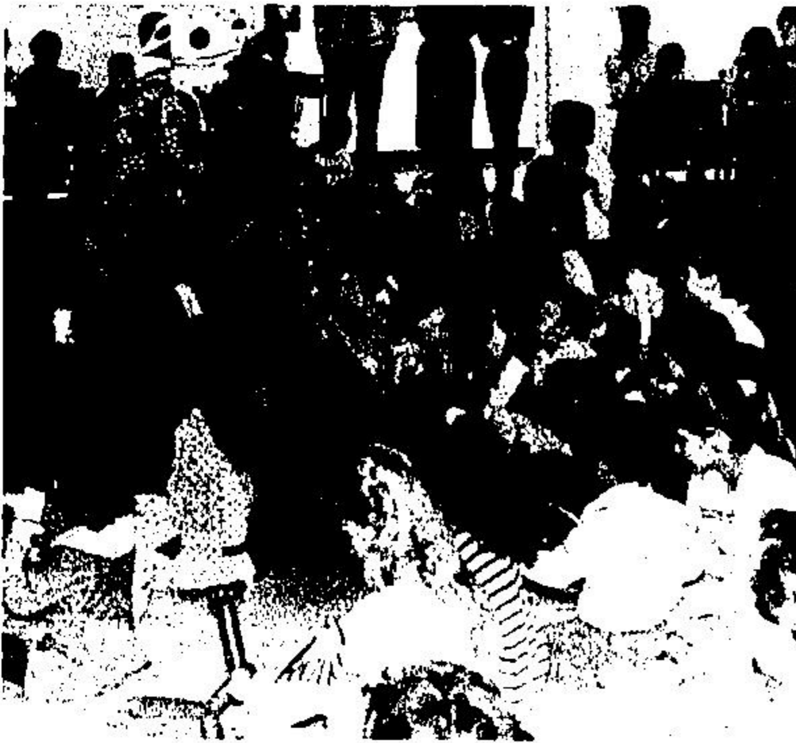
The Georgetown Newcomers Club held its annual Kids Christmas Party recently at the St. Andrew's United Church hall. Here the kids are entertained by clowns from Up Up And Away Balloons from Georgetown, while awaiting a visit from Santa.