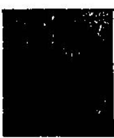
BEATRICE KECK Res. 853-0100