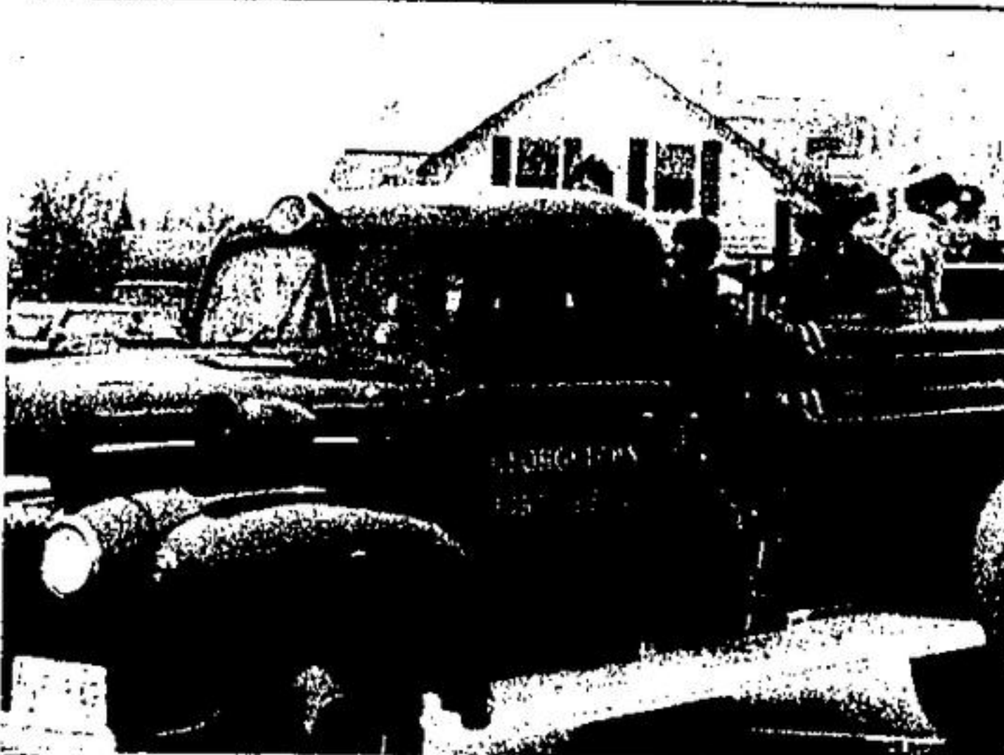
Firetrucks, old and new, led the 58th annual Santa Claus Parade through the streets of Georgetown on Saturday. The Lions Club sponsored the parade which was a hit with the kids. The grand finale didn't disappoint anyone as Santa and his reindeer galloped through the street.