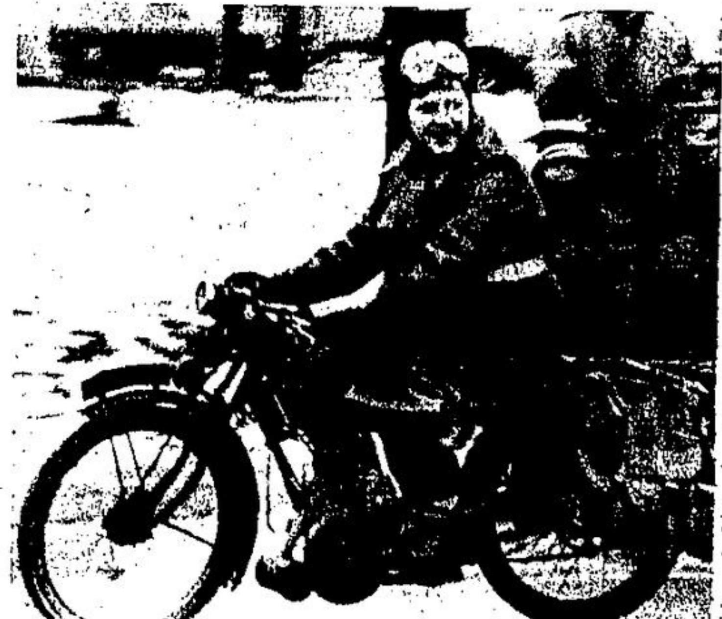
This man had plenty of fun at Saturday's Santa Claus Parade. He zigged and zagged through the streets as clowns and people riding on floats gave away candy canes and Christmas sweets. This old motorcycle looks as though it may have been in the very first Santa Claus Parade 58 years ago.