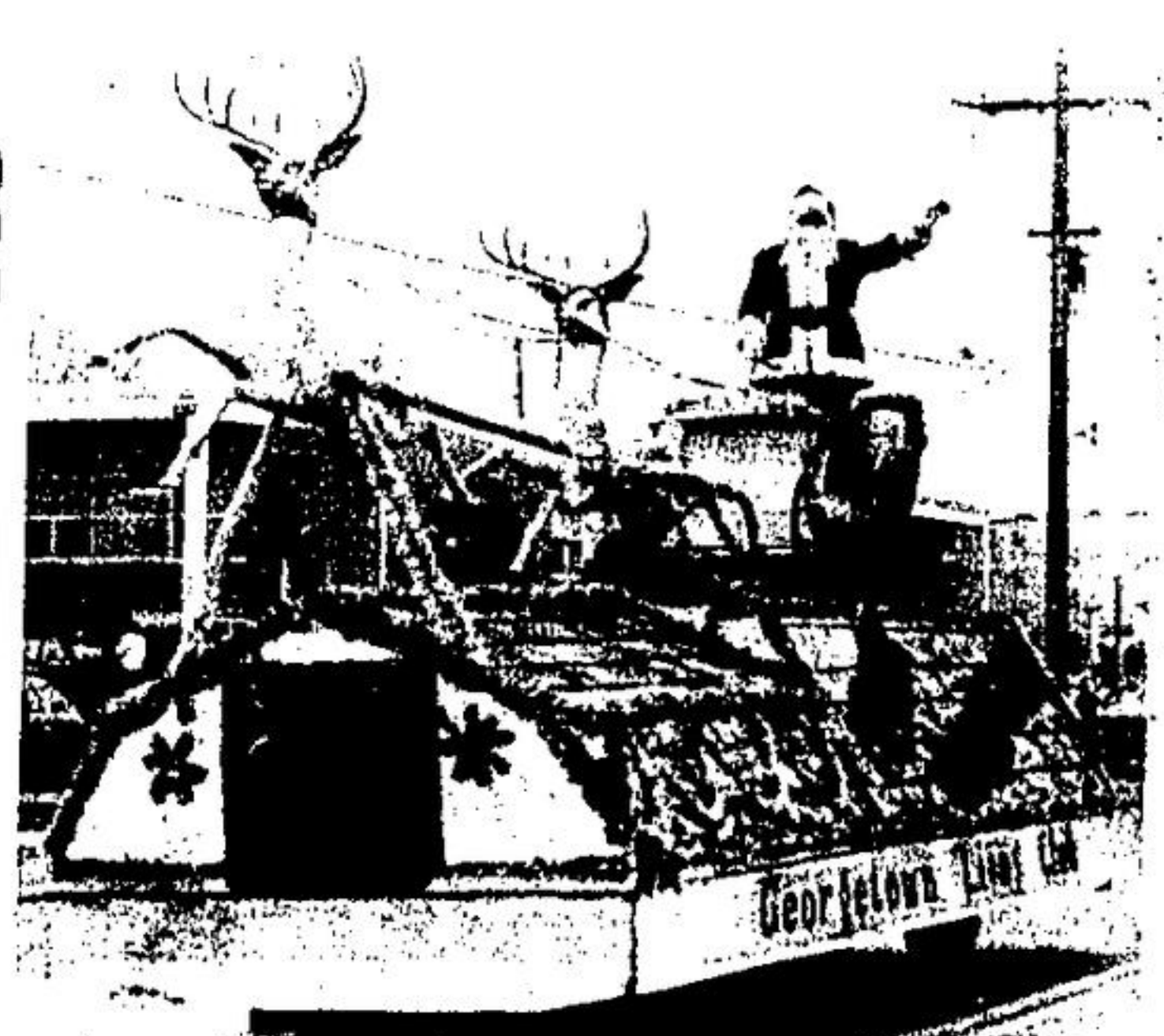
The Georgetown Lions Club organized the annual Santa Claus Parade Nov. 28. The merry man followed the parade which featured an "Old Brown Show" and Dorothy and Toto along with many other floats, bands and clowns.