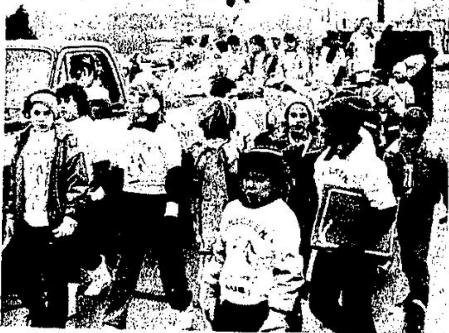
The CHICKEN club marched along with their mascot at the Santa Claus Parade Saturday. The foggy weather which threatened the parade held off and although the chicken completed the route no eggs were found in the street afterwards.