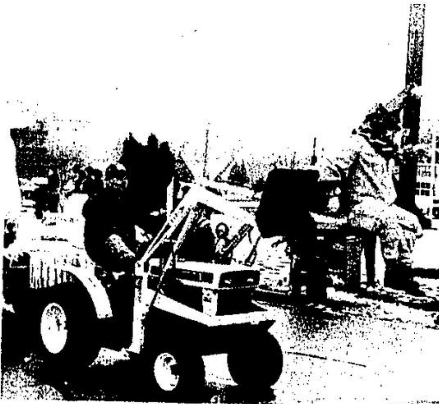
Clowns were popular with the kids at this year's Santa Claus Parade. Once they got off the hot seat, like this high flying clown, they danced up and down the street giving out candies and wishing Merry Christmas.