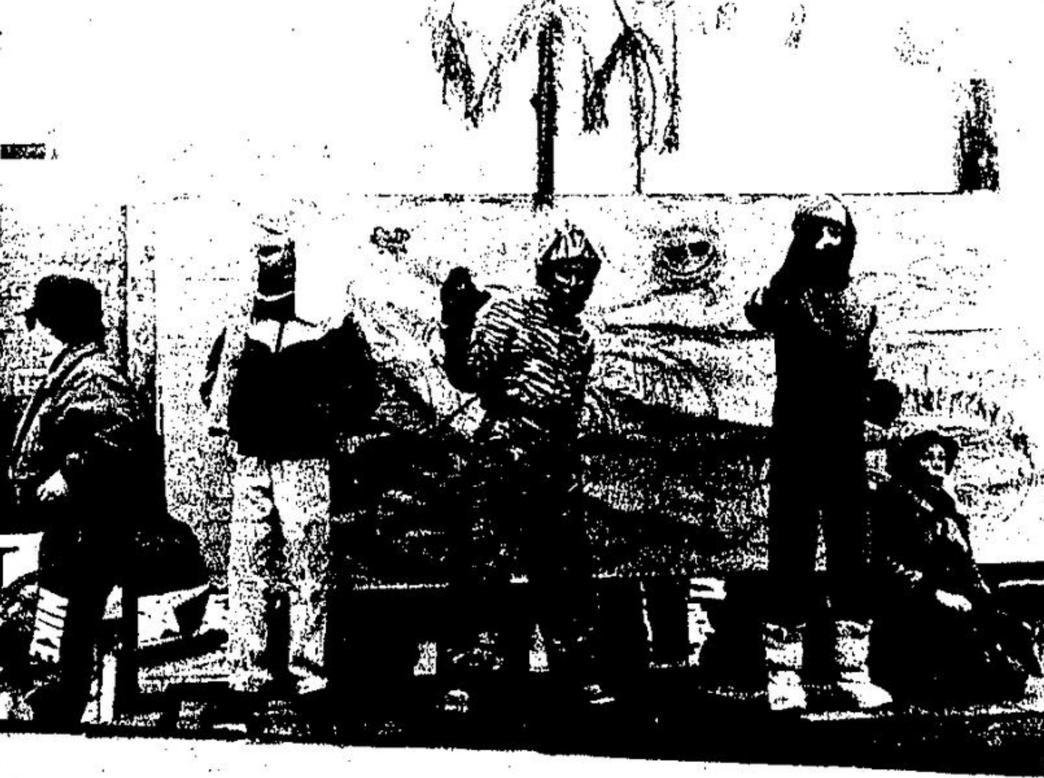
While this floppy eared elephant is looking at the path ahead the tiger and friends waved to the crowd watching the annual Georgetown Santa Claus Parade Nov. 28. This float was one of many which made their way from the Delrex Plaza to downtown Georgetown via Maple Avenue. The fog and cold didn't keep the people away though as they lined up to see the action.