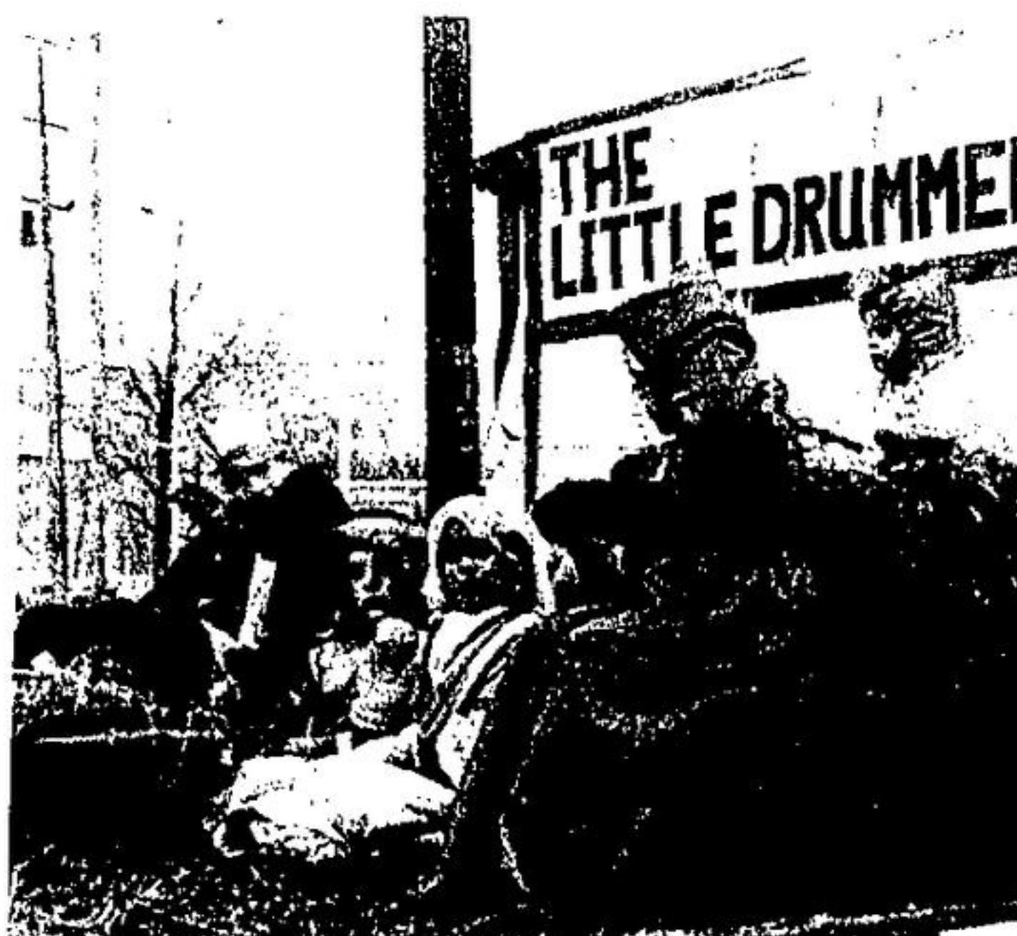
The Little Drummer Boy was alive and well during the Georgetown Santa Claus Parade Saturday. But even the drummer boy and the wise men had to bundle up because of the chilly day. Various floats and marching bands took part in the procession.