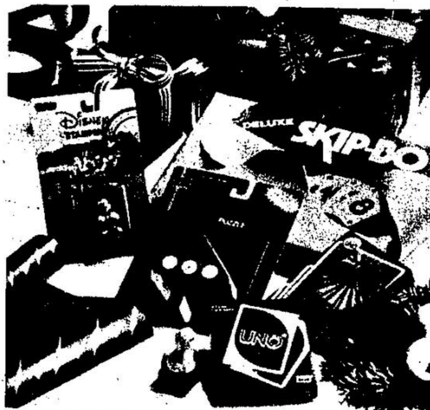
CHRISTMAS COLLECTION: Games, puzzles and small activity toys are a good choice for holiday stocking stuffers and grab bag gifts. This assortment from International Games includes Deluxe Skip-Bo, about $10.00; UNO, about $4.00; Stun, about $3.50; Optical Conclusions, about $3.00; and Stampus, around $2.00.