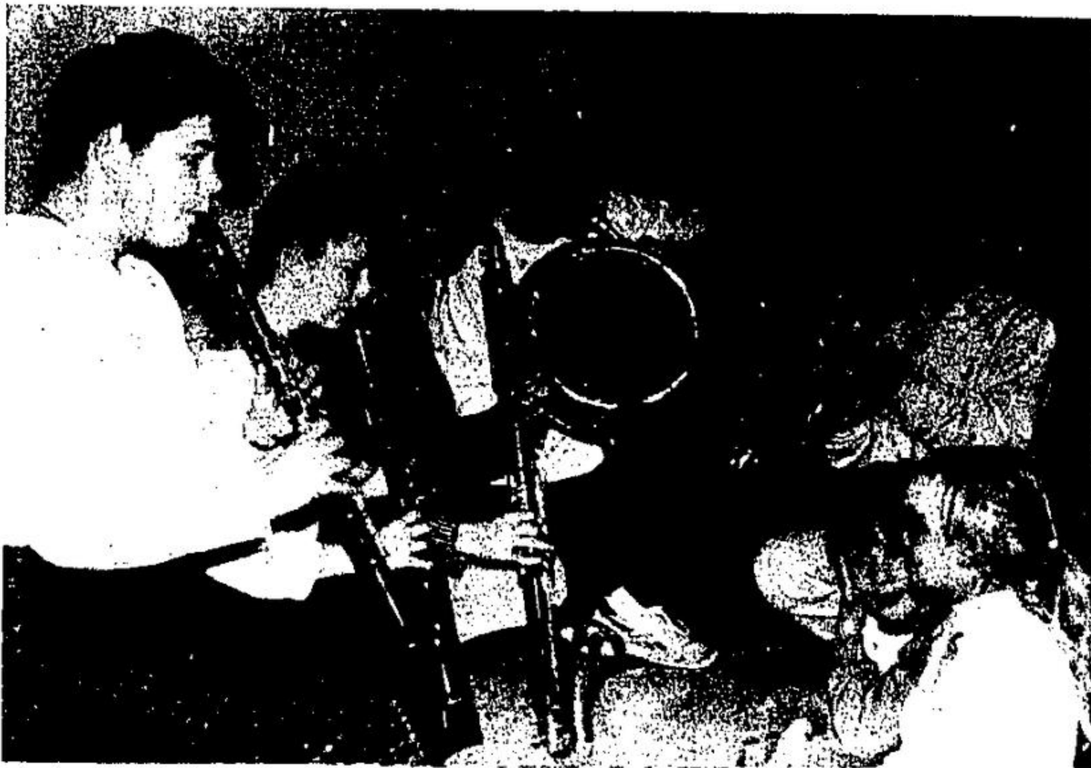
Music to their ears

Georgetown District High School students gave Pineview School kids a first hand lesson on musical instruments Nov. 13. GDHS students were briefing the kids on the workings of the wind instruments before the Pineview students travelled to Hamilton Place Nov. 17