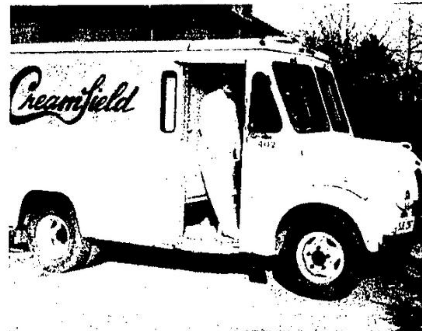
This Creamfield milk truck is a real find for the movie Almost Grown. Vehicles were required for the film which would depict life in the 1960s. Fortunately an Acton man came to the rescue after an ad was placed at the Milton Steam Era show in September.