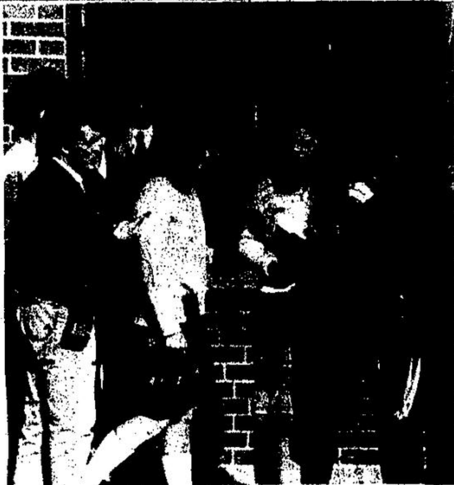
An assistant director converses with a member of the crew while trying to get together some of the background actresses or 'extras' needed for the next scene. The time taken between actual shooting of the scenes can take hours.