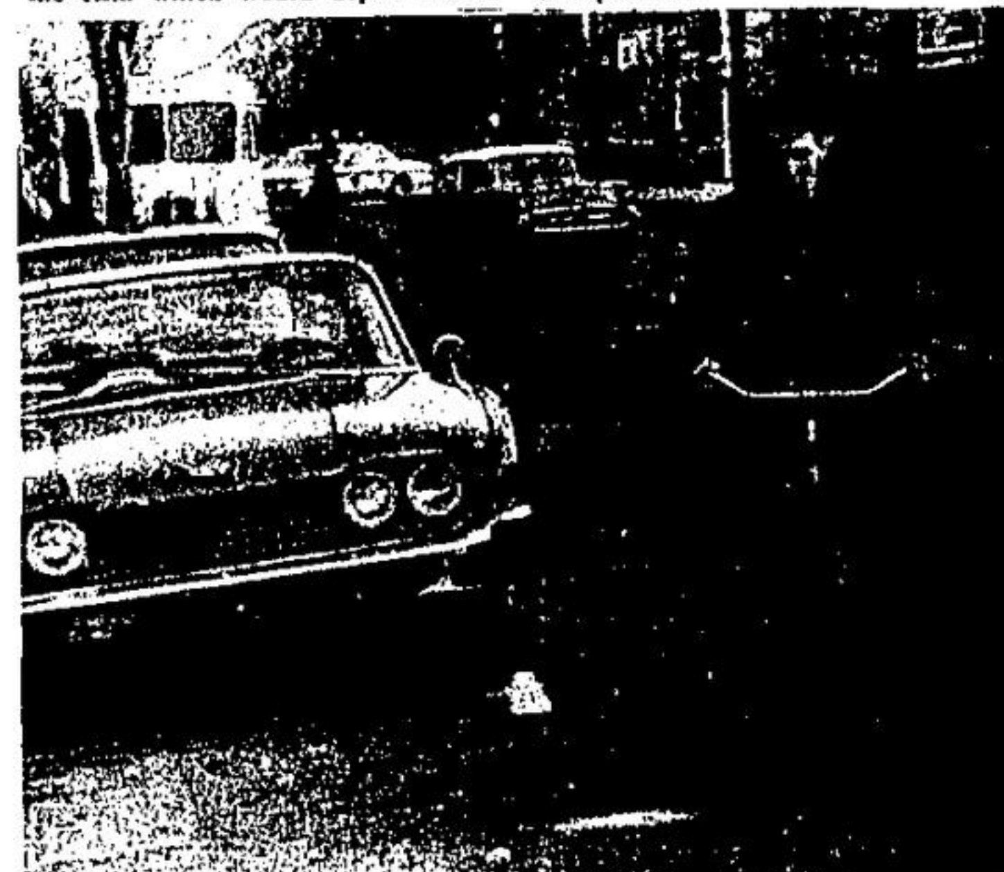
The look of Main Street in downtown Georgetown took on a transformation Sunday when movie crews rolled into town for the shooting of a film called Almost Grown. Here, action on the street includes old-style bicycles, vintage automobiles and actors walking along the sidewalks posing as pedestrians.