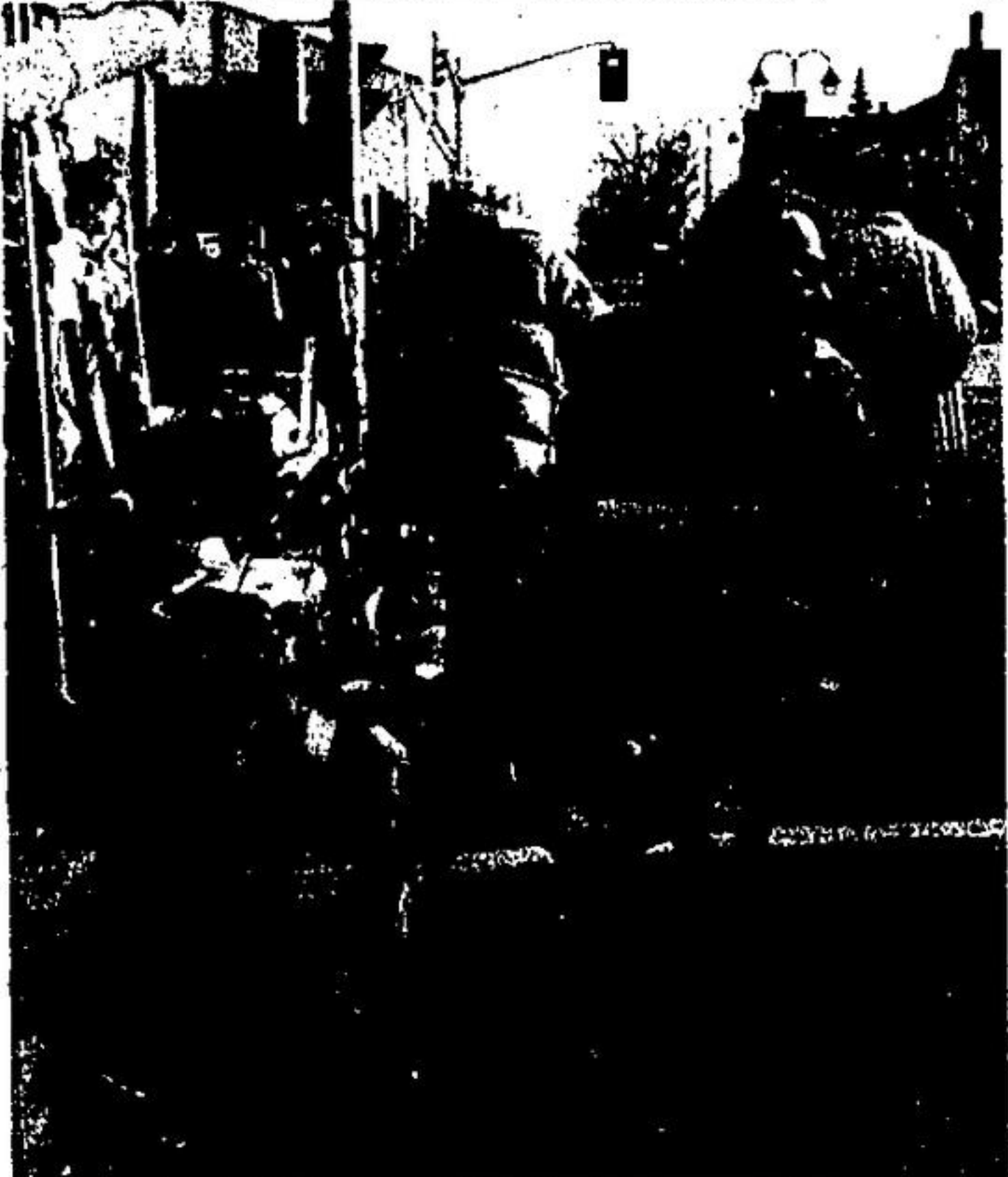
With the sound equipment and lighting ready, all everyone is waiting for is the actors to get their lines straight. It takes many tries before a scene is shot. Here, at the corner of Main and Mill Streets in Georgetown Sunday, crews prepare to film a scene from the movie Almost Grown.