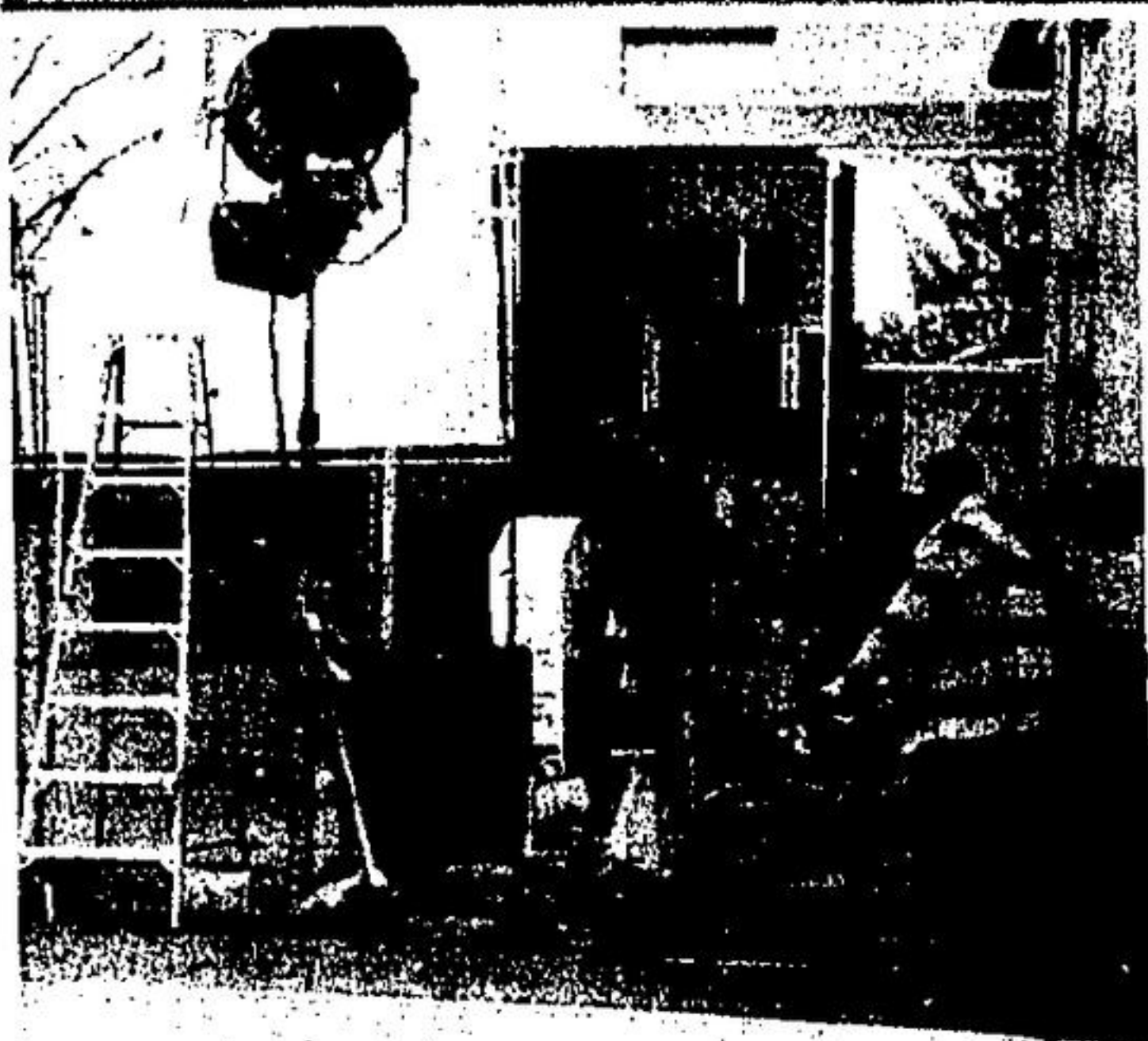
In this shot, the Main Street fish and chips store is being used by the camera crews to shoot action outside on the street. Pedestrians, cars and bicyclists are used as backdrops while the main character, Norman rushes by as his dad watches from inside the coffee shop.