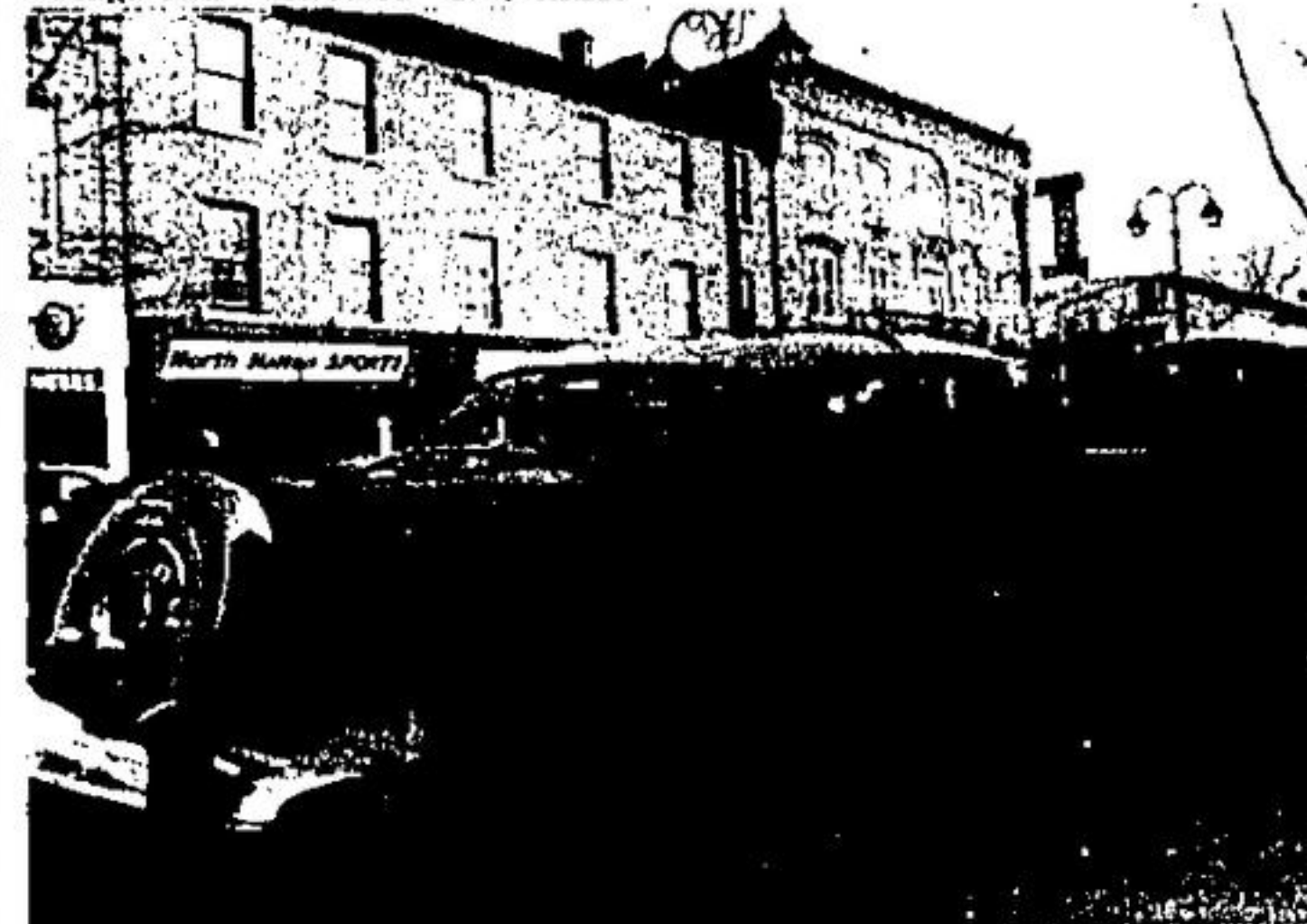
One of the highlights for those observing the movie-making on Georgetown's Main Street Sunday was viewing all the vintage cars which were being used for the shoot. Some of the cars belonged to local members of the Georgetown car club.