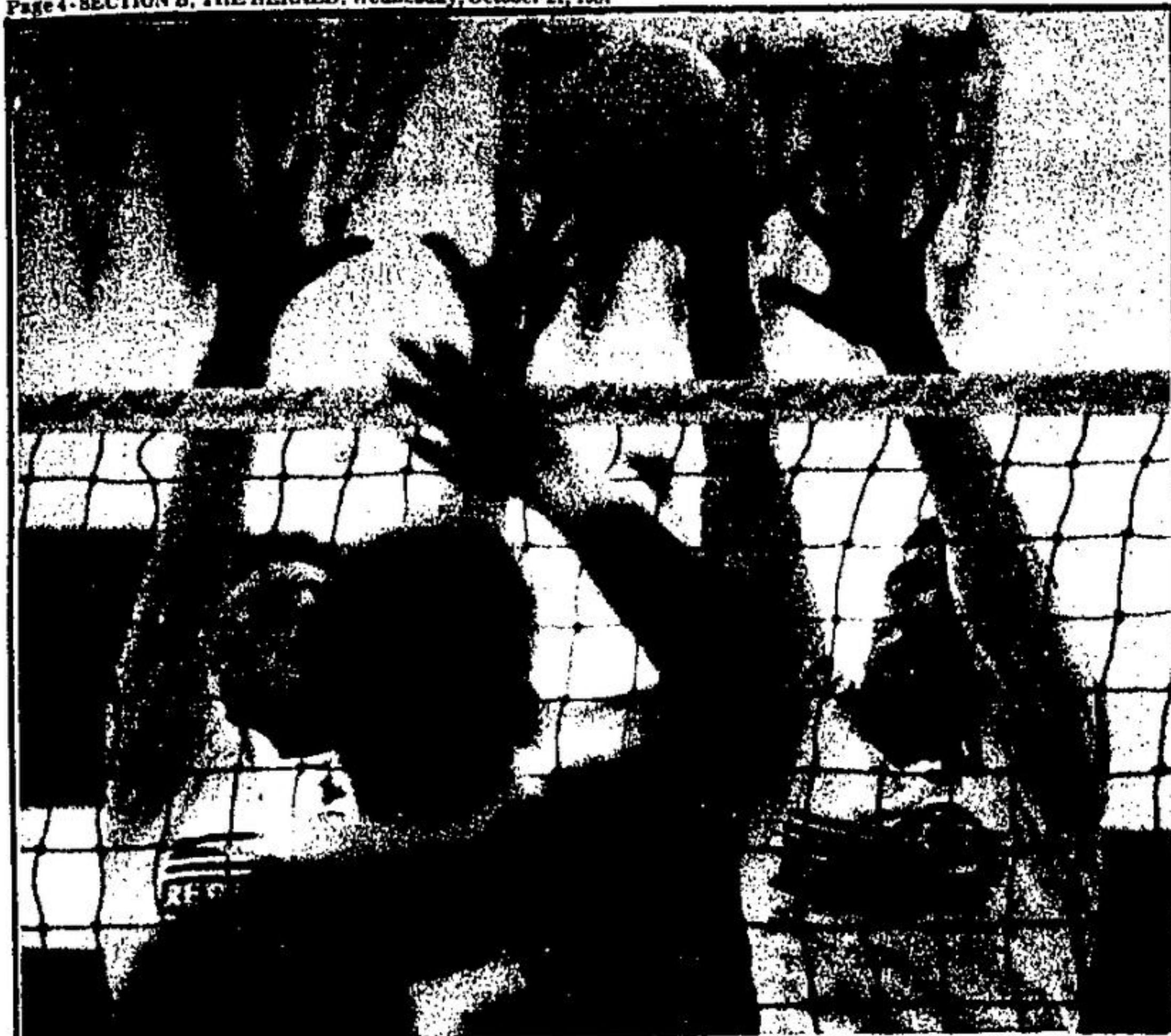
MENTAL BLOCK - Two GDHS Junior volleyball match, marking the first loss for the Junior Rebels in players go up to block a White Oaks shot during action three seasons. Thursday in Georgetown. White Oaks prevailed in the