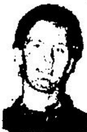
Georgetown High

GDHS, though it did get off to a rather rocky start, but the team is now ready and willing to return to its winning ways of recent years. Good luck!