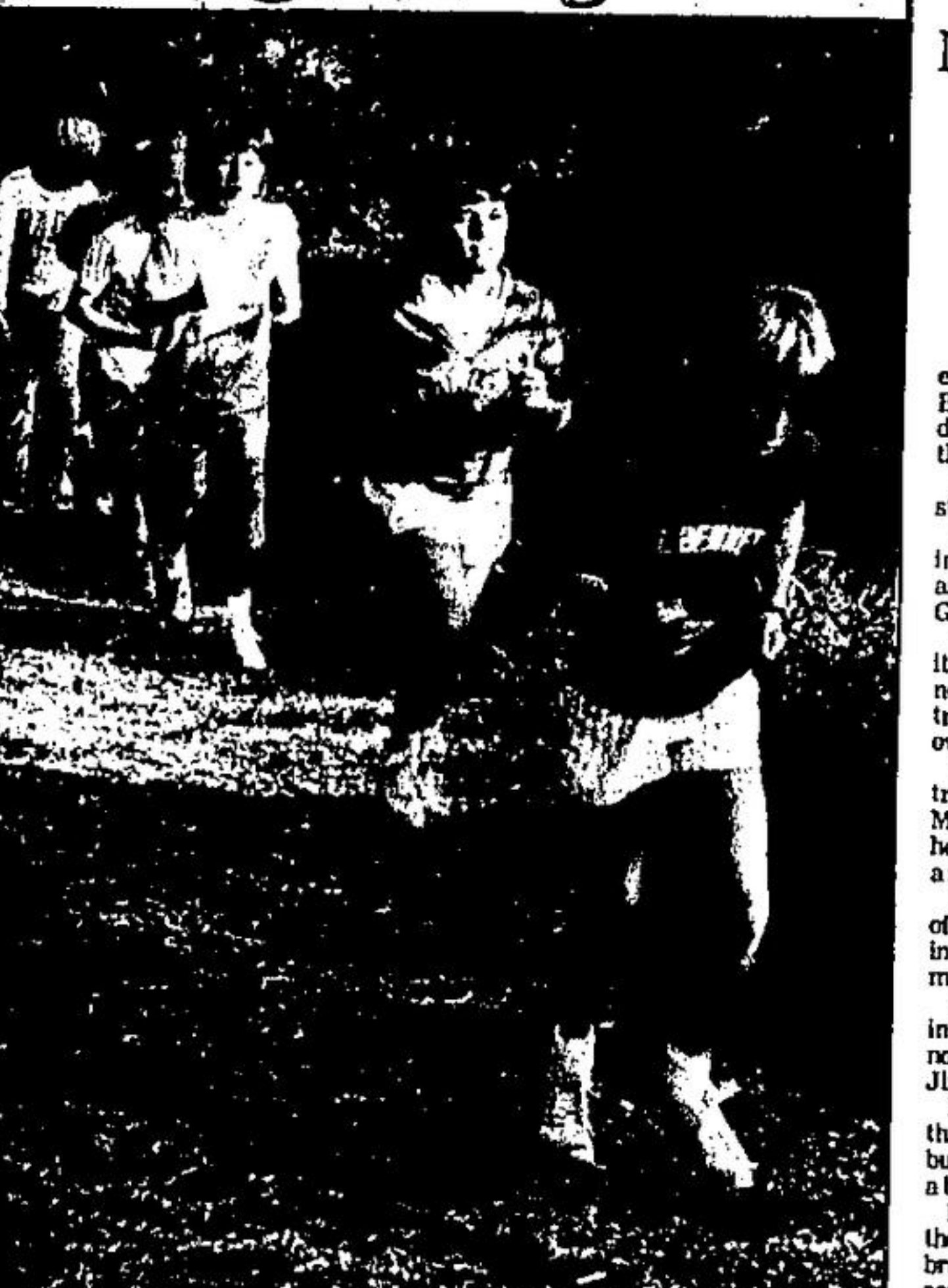
One of the toughest portions of the cross country course at Cedarvale Park was a hill that many of the runners chose to walk up. The runners were taking part in a cross country meet for North Halton public schools.