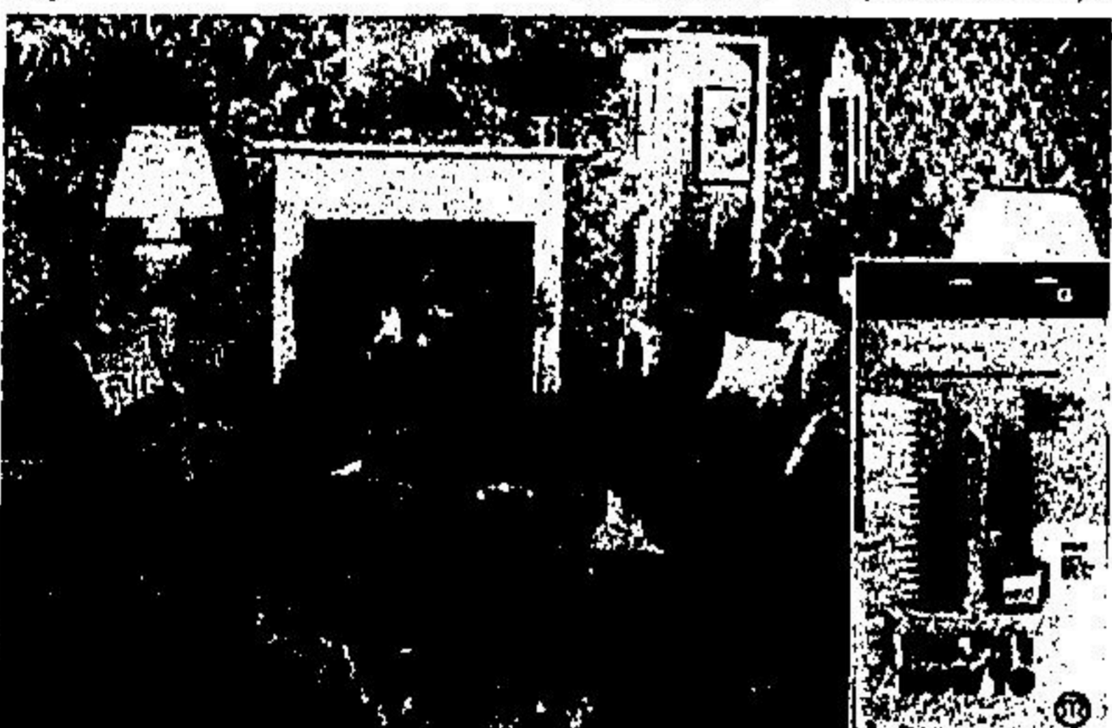
EVEN NOVICE DO-IT-YOURSELFERS will find the task of wallpapering simplified — and the professional look of a room like this within their abilities — with the help of the wide range of handy tools available from Red Devil, Inc. Inset, above, Red Devil's Wallpaper Hanging Kit, which includes the basic tools needed to tackle the job.

Red Devil's new Wallcovering Kits spell all this information out clearly with "user friendly" instructions. They're available at your painting and decorating retailer.