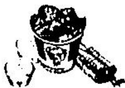
20-Piece Barrel Special 20 pieces of Kentucky Fried Chicken, 2 x 500ml salads, with bread.