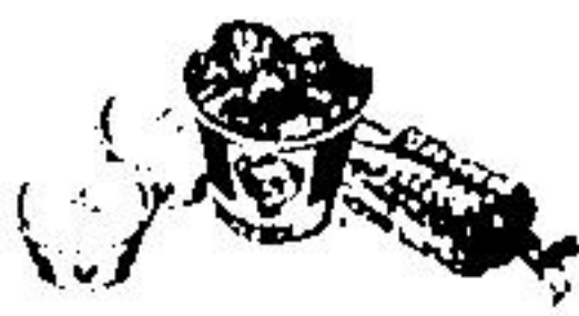
15-Piece Bucket Special 15 pieces of Kentucky Fried Chicken, 2 x 500ml salads, with bread.