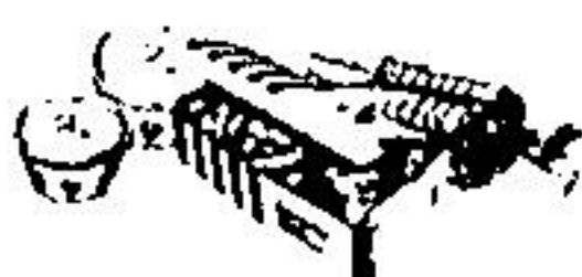
9-Piece Thrift Box Special 9 pieces of Kentucky Fried Chicken, 1 x 500ml salad, and 1 x 250ml salad, with bread.

When you're driving by your nearest Kentucky Fried Chicken outlet, from October 5 through November 1, you can pick up a special offer on three different-sized meals of delicious Kentucky Fried Chicken. Look for details inside every participating outlet.