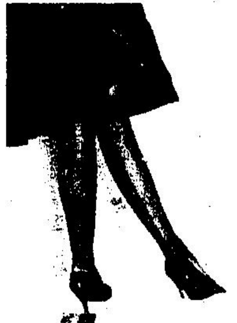
BLACK is the leading hosiery color for fall. These Hanes Diamond Arrow hose with mock black seam (about $6) are a flirty evening accompaniment to a short skirt.

Over-the-knee boots are another hot alternative to wear with short skirts, because they create an unin-