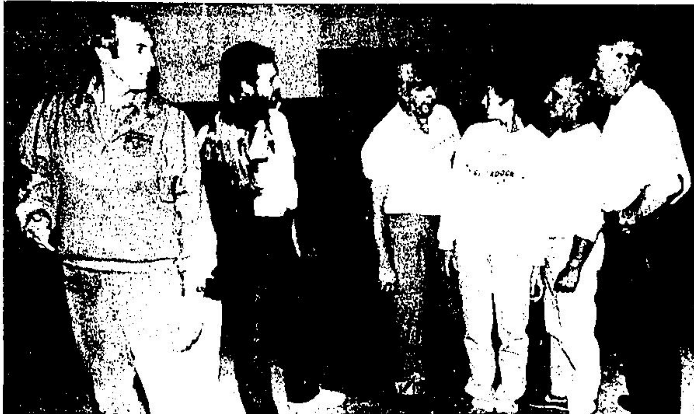
Playing a role