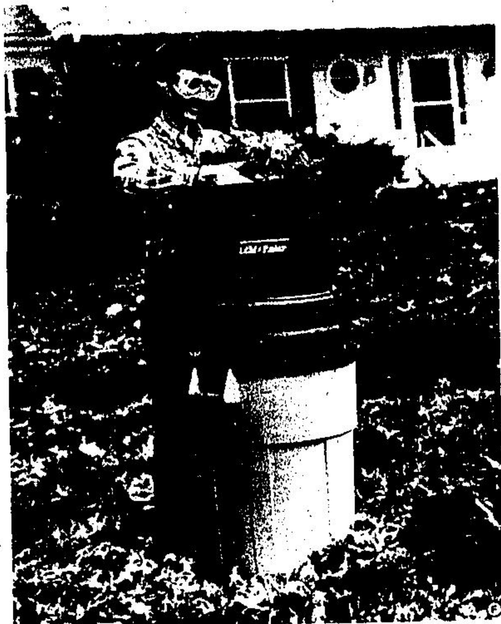
DISPOSING OF FALLEN LEAVES need not be strenuous or costly. This Vornado Leaf Eater® "custom shreds" leaves—wet or dry—as fast as they can be loaded into the bushel-sized hopper. Shreds eight bags of unshredded leaves down to just one tidy bundle for simple, clean disposal, or for use as garden mulch.

For the name of a dealer near you, write to Vornado Power Products, 2 Main Street, Melrose, MA 02176.