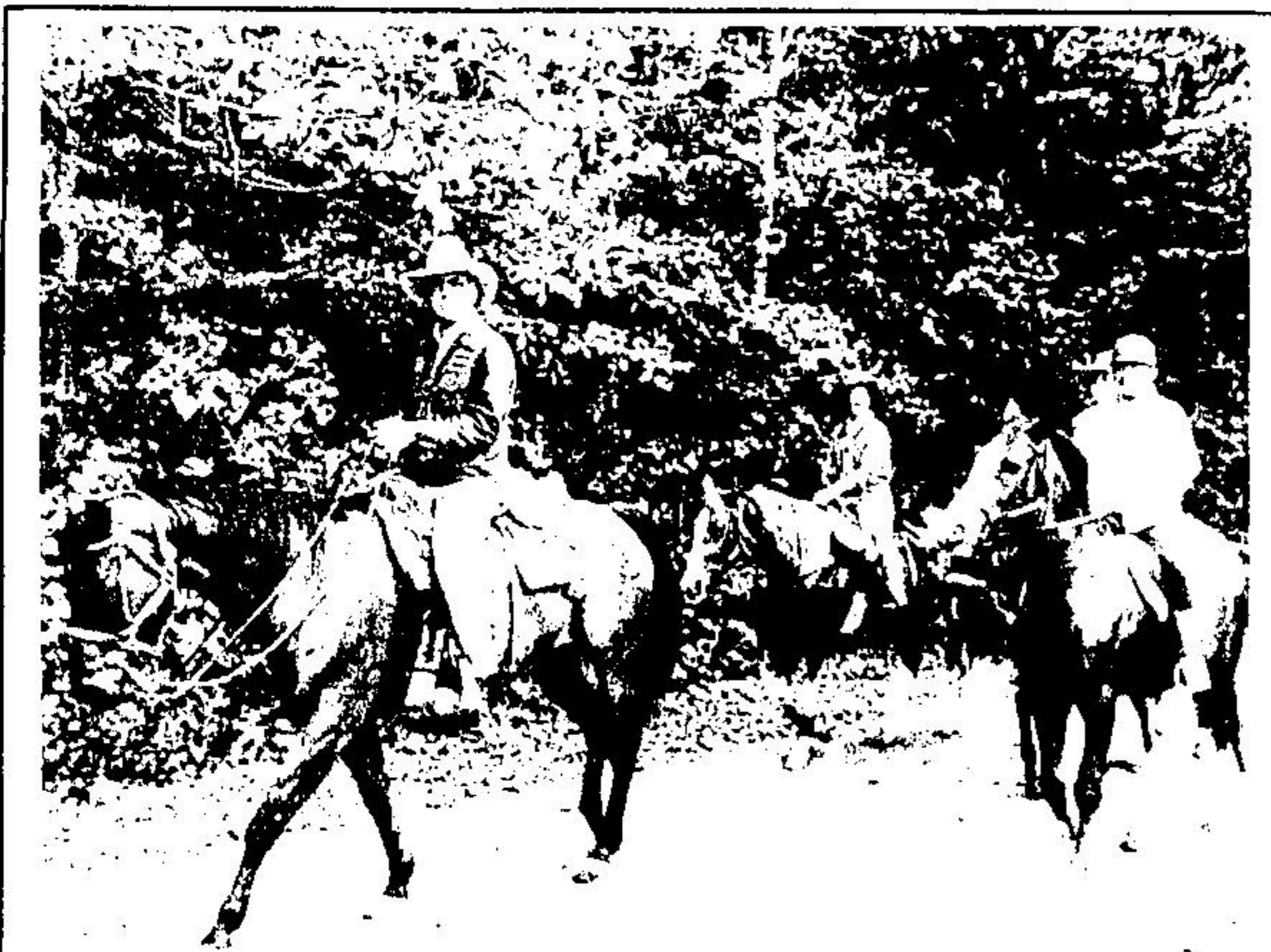
The Ontario Trail Riders Association ended its day-long ride Sunday at 6 p.m. at Scotsdale Farms near Ballinafad. The small group experienced some soggy ground along the way but the sun was shining for most of the day, making the scenic autumn ride an enjoyable one.