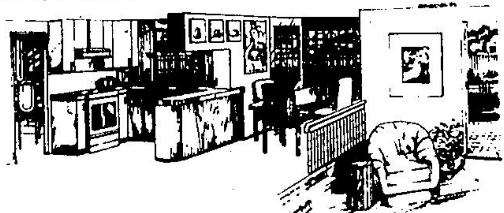
Open Plan Kitchen overlooks Family Room