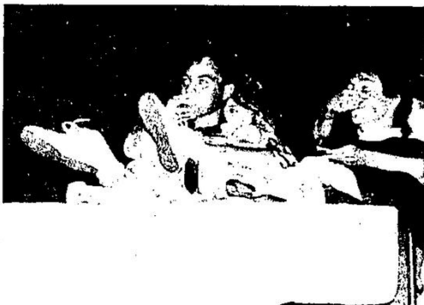
Some of the performances at the Recreation Department's Variety Night Thursday at Centennial School ranged from peculiar to bordering on bizarre, particularly when these "Little people" took the stage to entertain.