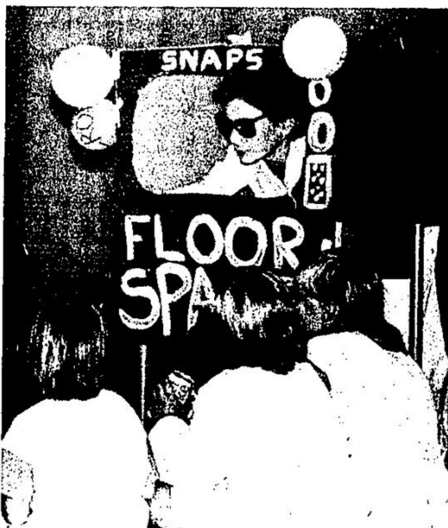
Television commercials were parodied during Thursday's Variety Night at Centennial School. Members of the Summer Activities Centre in Acton tuned the audience in to such popular ads as Croke. (Catch the wave!)