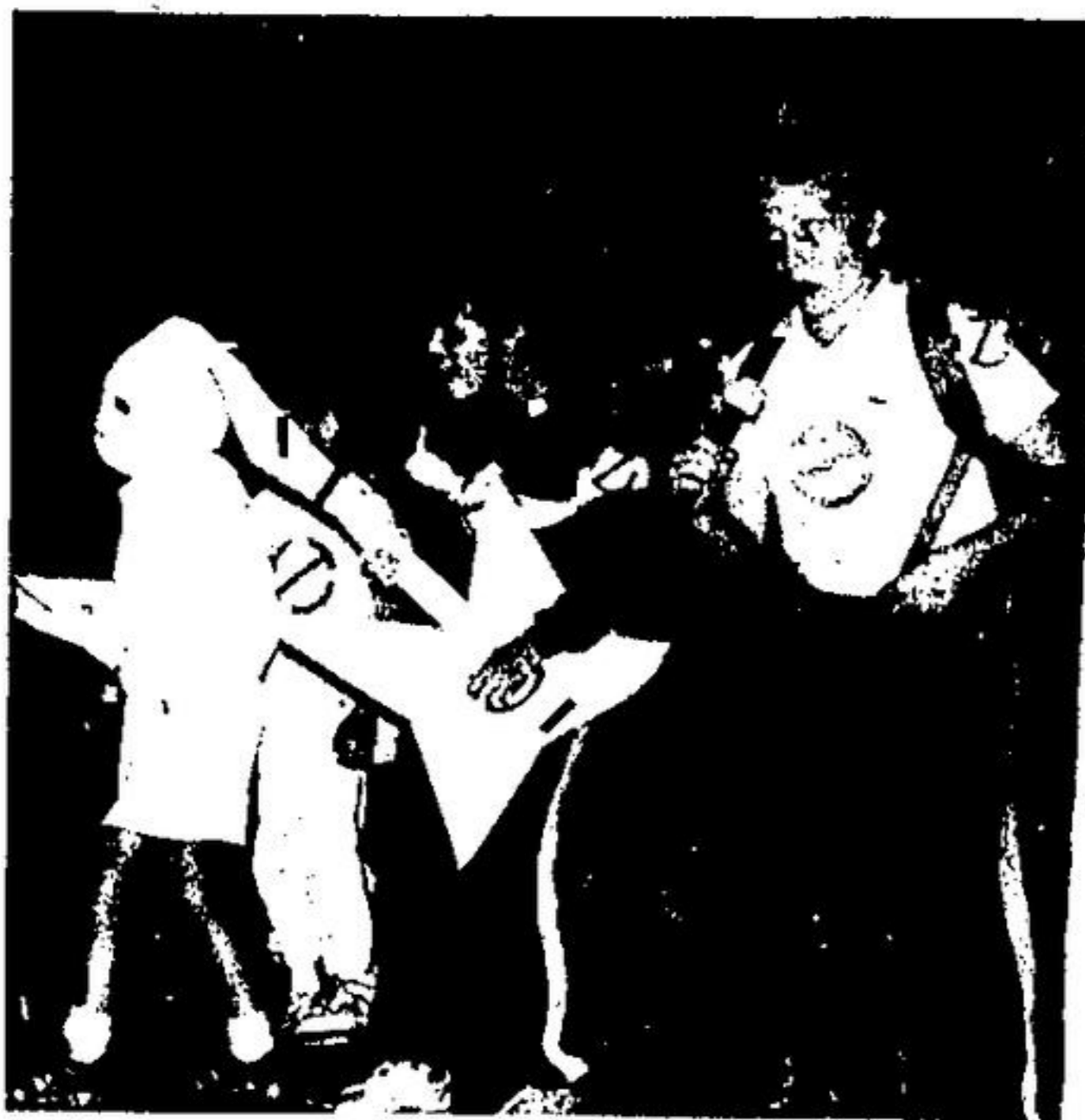
A number of wild and woolly looking groups took the stage for the Department of Recreation and Parks Department's Variety Night Thursday at Centennial School. Day Camp participants presented "air band" performances and it wasn't hard to tell who this group fashioned their show after. Who ya gonna call?