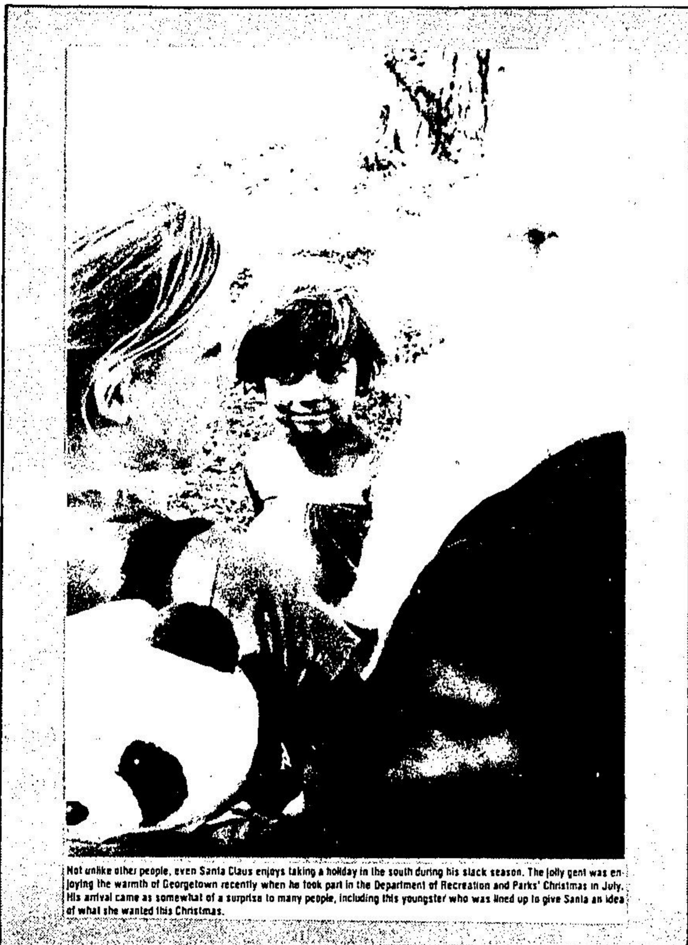
Not unlike other people, even Santa Claus enjoys taking a holiday in the south during his slack season. The jolly gent was enjoying the warmth of Georgetown recently when he took part in the Department of Recreation and Parks' Christmas in July. His arrival came as somewhat of a surprise to many people, including this youngster who was lined up to give Santa an idea of what she wanted this Christmas.