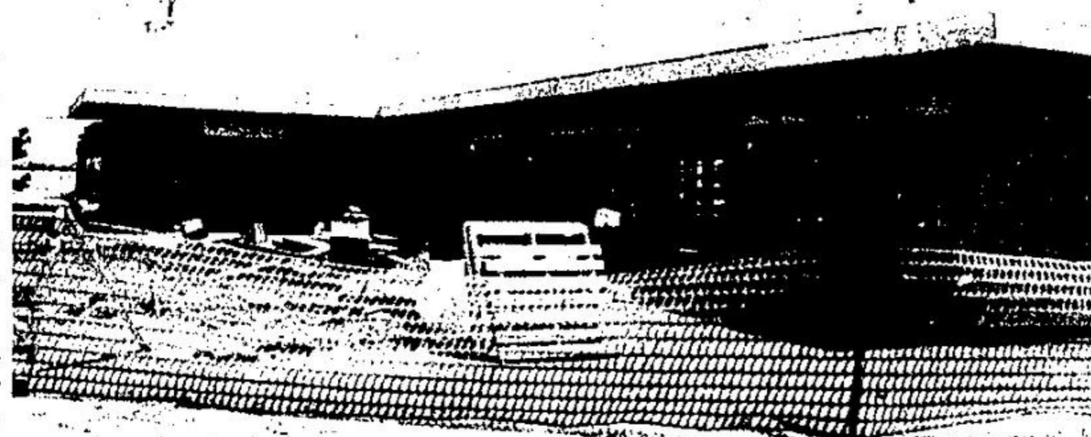
A 3,000 square foot retail and office building behind the Pizza Hut at the Georgetown Plaza is expected to be completed by September. The $120,000 project is being developed by Jack Petersdorfer Trust.