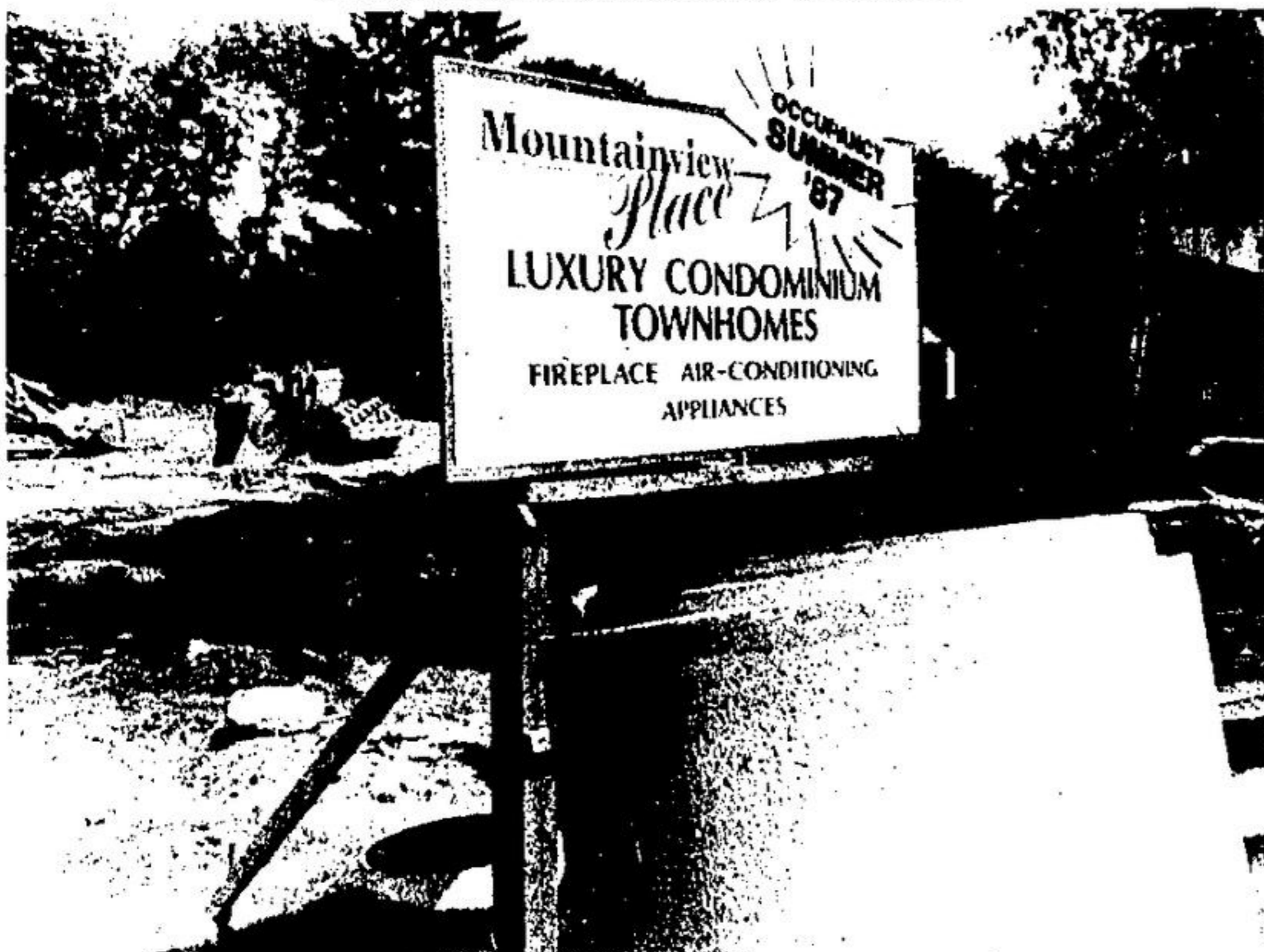
Construction of the luxury condominiums on Mountainview Road at King Street is well underway with the expected completion date set for sometime in November. The 22 unit condominium will have two floors. The project costs approximately $2 million said owner-developer Lorne Roberts.