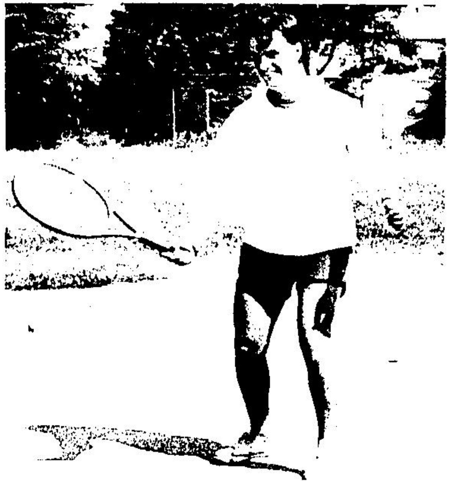
Returning a volley is tennis player for the Halton Hills Recreation and Parks Department.